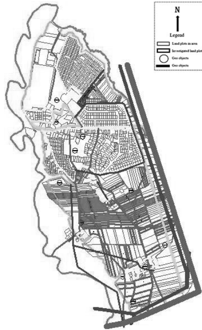
Fig. 2. The layout of geo-object criteria (scale 1:25000)