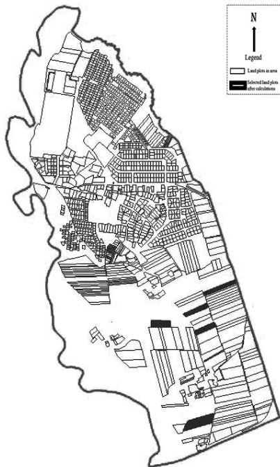
Fig. 3. Selected land plots after calculations (scale 1:25000)