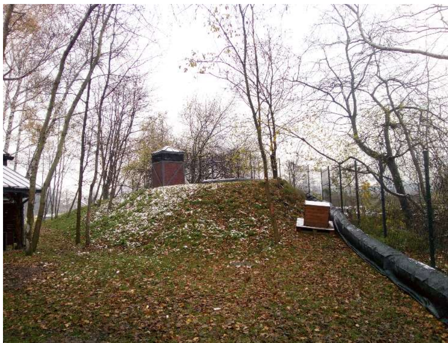
Fig. 9. The air duct installed at the surface for the recuperation - the opening W(2015a)