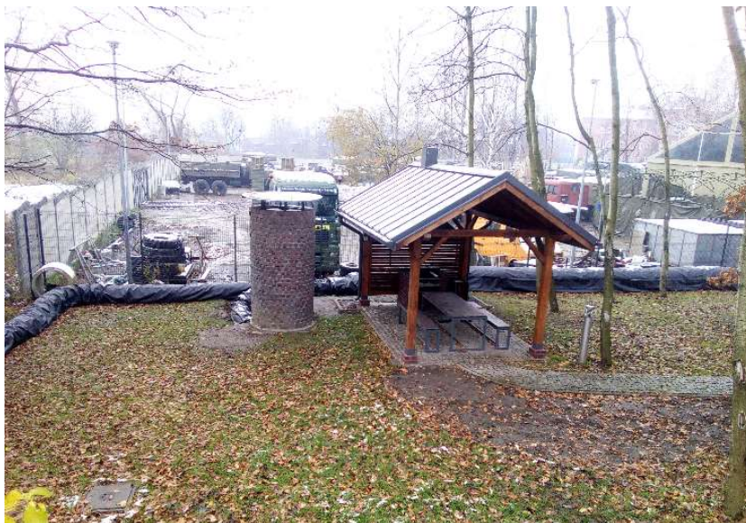
Fig. 8. The air duct installed at the surface for connecting the opening W(2015) with the opening W(2016) and W(2015a) - the recuperation – the opening W(2016)