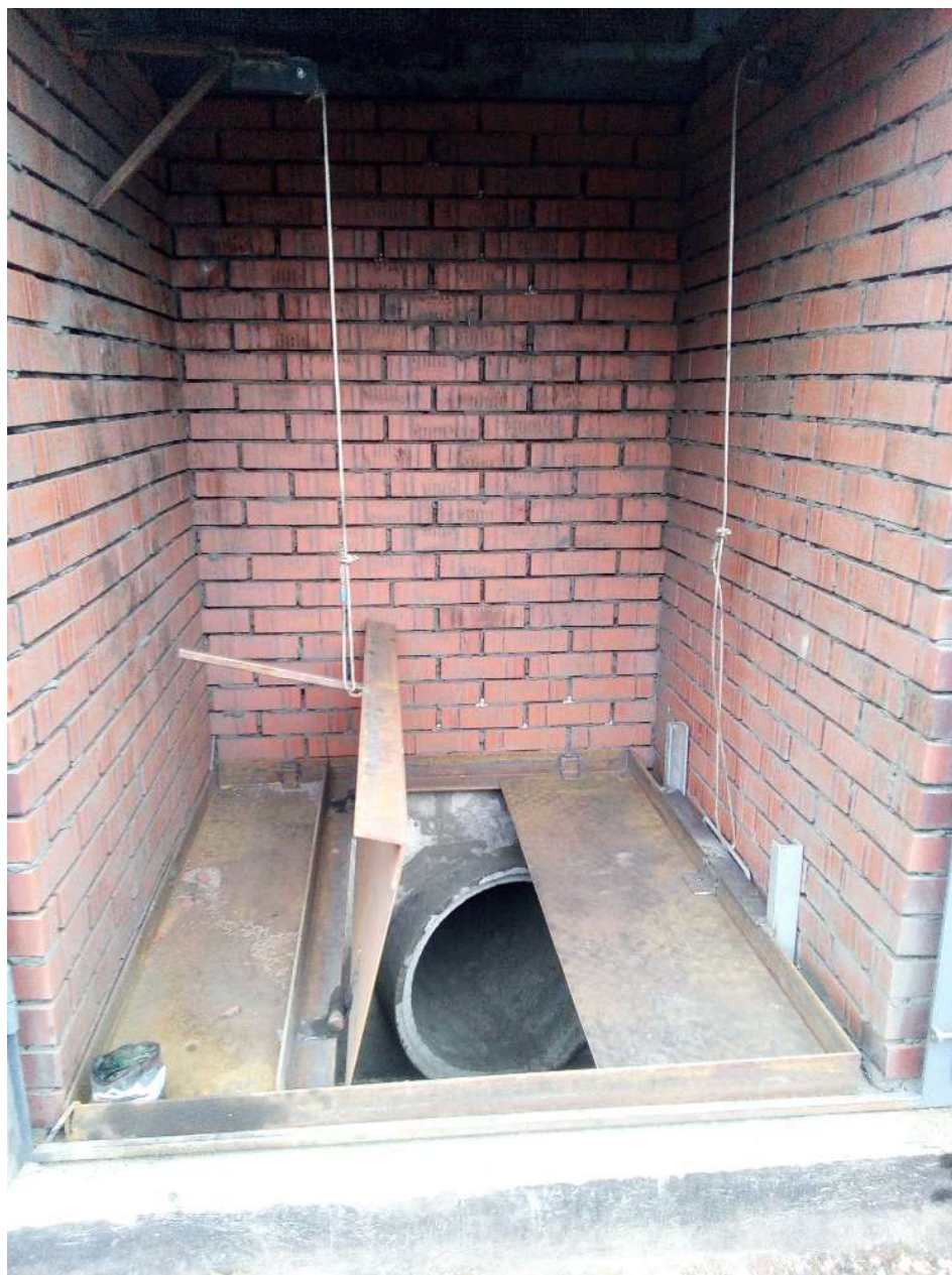
Fig. 5. The opening W(2015) – the regulation window - view inside