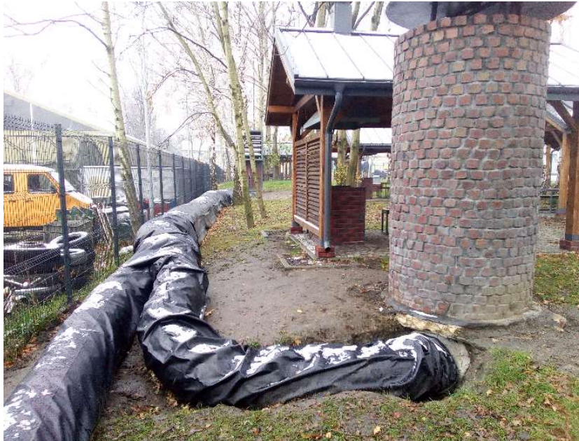
Fig. 7. The air duct installed at the surface for connecting the opening W(2015) with the opening W(2016) - the recuperation