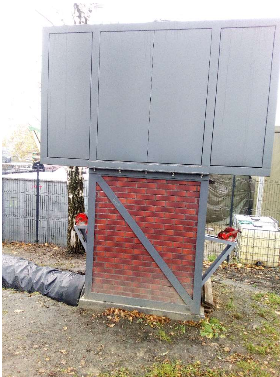
Fig. 6. The opening W(2015) – the regulation window – outside view