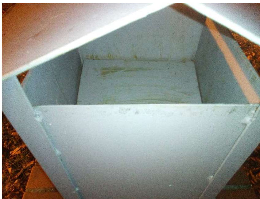
Fig. 3. The skylight No. 3 – the regulation window