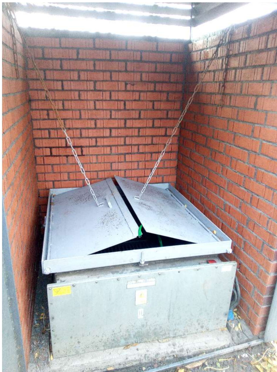
Fig. 4. The opening W(2015a) – the regulation window