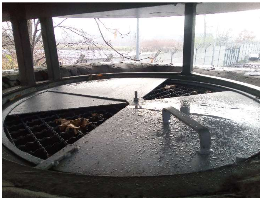
Fig. 2. The opening W(2016) – the regulation window