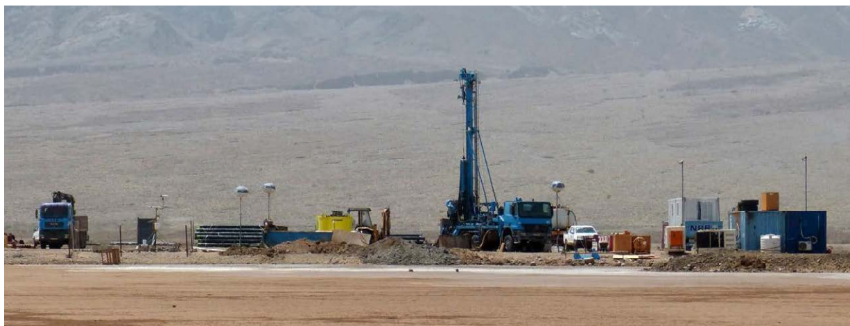
Fig. 2: Drill pad during well cementation of the final 9-5/8" casing, drill rig Nordmeyer DSB 3-14 of the Company Nord Bohr- und Brunnenbau

Ryc. 2. Cementacja osłony szybu wiertniczego, wieża wiertnicza Nordmeyer DSB 3-14 firmy Nord Bohr- und Brunnenbau