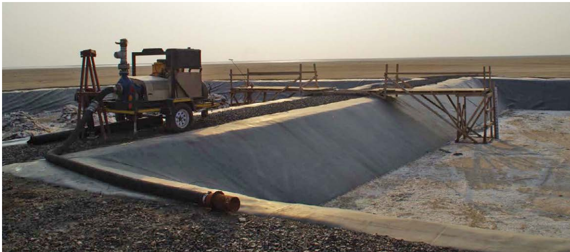
Fig. 4. Evaporation pond with a mobile brine pump. The pond in the background is harvested and the pond in the fore ground is ready for filling

Ryc. 4. Staw ewaporacyjny z mobilną pompą solankową. Staw w tle jest gotowy do eksploatacji, a staw z przodu jest gotowy do wypełnienia.