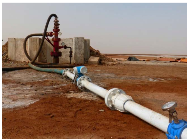
Fig. 3: Well head of the test well SolMin01, in the foreground the monitoring devices on the brine line

For the initial test well operation a diesel blanket was applied. A suitable blanket system facility comprising of two pumps and tanks was erected. After an unwanted cavern development towards the Bischofite layer the blanket medium was changed to use compressed air. K-UTEC designed and delivered the blanket system and the test work could be continued after securing the Bischofite bed with compressed air. After a Kainite cut the Bischofite bed was bridged with brine and finally the Sylvinitic was leached. Subsequently a performance test of the well was carried out applying a higher volume flow. Figure 3 shows the well head of the test well together with the control devices on the brine line.