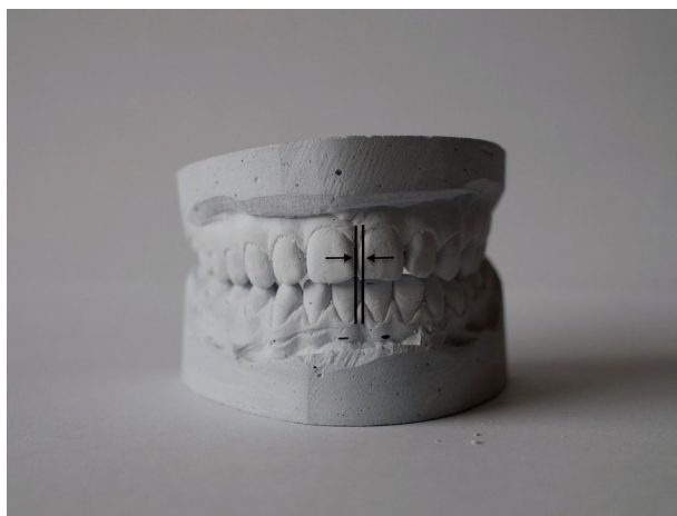
Fig. 1. Illustration of the method of measuring the incisor midline discrepancy (mandibular shifted to the right was scored as positive)