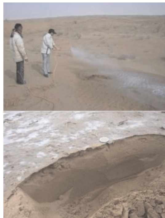
Fig. 2. Mulch spray using a tractor mounted sprayer

The project was implemented based on a split plot in the form of the basic randomized complete block design. The treatments were included in the planting procedure (including cuttings and seedlings) using the mulch solution amount 0 t/ha (control), 5 or 10 t/ha. The measured parameters were: temperature (15 cm deep), moisture (15 cm deep) using time domain reflectometry (TDR) device (model \Delta\text{AHH2} ), plant survival and rate of erosion wind (by wood markers installed). The planting distance was 3 x 3 m in 7 rows (repetition) and 7 columns (the number of seedlings per repetition). For example, the number of plants ( Calligonum ) grown in each mulch treatment was equal to 49 bases, with totally 147 bases in different three mulch treatments. In order to create a smooth and balanced surface, all the margins of the region were covered by mulch. The test units were single sand dunes so that a 2000 m 2 dune was considered for each mulch treatment (6000 m 2 total area). The thickness of crust formed on the sand dune surface after the mulch solution treatment in amount of 10 t/ha was equal to 9 mm and after the treatment with 5 t/ha it was equal to 4 mm. Finally, data collected in the SAS environment was analyzed by ANOVA