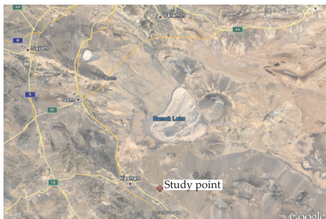
Fig. 1. Study area in the desert of Kashan in central Iran

Frictional resistance of the formed layers was measured by rubbing a sandpaper with medium roughness (100 \mu\text{m} ) and compressive force of 4.9 N on their surface continuously until the layers were abraded and reached the loose soil surface. The number of times of rubbing sandpaper on the soil surface until eroding the layer was