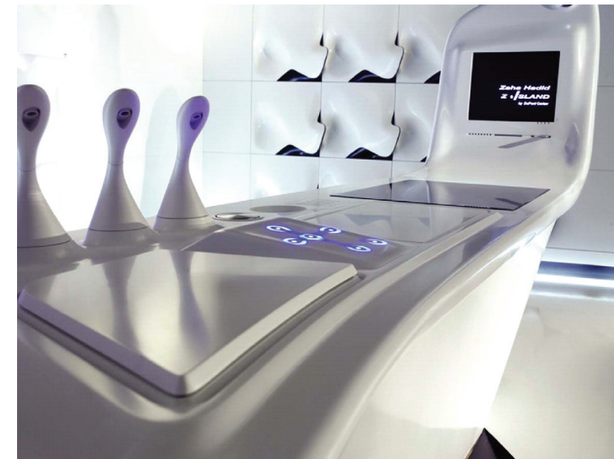
Il. 4. Futuristic kitchen made of Corian – Z. Island. Author: Zaha Hadid. Ernestomeda company in cooperation with the DuPont company

cultural and spiritual needs of a society that largely determine the creation of expressive furniture forms with a variety of art-shaped displays. This, in turn, depends on their composition-structural features. You should use the full arsenal of composition tools, such as aspect ratio, optical illusion, color, the ratio of light and shadow, emptiness and volumes of bodies, color and scale. Along with the multi-variance of construction and ergonomic solutions it is important to ensure the unity of style of the whole subject-spatial environment, the integrity of the composition and visual identity as a separate unit of furniture, so furniture systems [1].