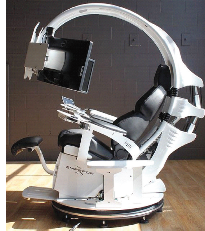
Il. 3. Examples of an electronic workplaces: jojo post tech gate: man chair: umbergizmo.com

of robotic signs in furniture for the disabled; such furniture directly affect the adequacy of performance of people with disabilities in various operations.