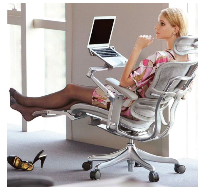
Il. 1. Samples of a mechanical arm-chairs: the apparent simplicity of the furniture is offset by the grace and elegance of the lines sensitively balanced between the elements of shape, delicate harmony of colors and textures, high quality performance (Ergonomic Chairs at home-decortubs).