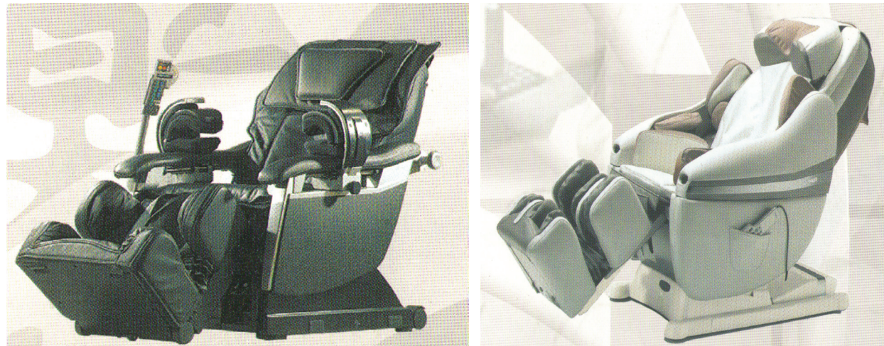
Il. 2. Samples of electronic furniture: a) the Inada Family D.1 (medical equipment): radio.com.ua. b) Family Sogno (medical equipment): info@radio.com.ua

Therefore, in the world practice there are certain trends in the furniture robotic or semi-robotic systems (fig. 3). Such furniture will have an expressive technical, electronic features with mechanic and robotic kinetism of functions. In addition, it is to notice the importance