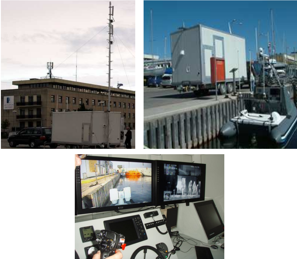
Fig. 5. The command post (the container) and its equipment [R&D project No. 0 R00 0004 07 documentation]

On the basis of the above mentioned project over the period 2011–2012 a consecutive project, No. R00 0106 12 called ‘Integrated planning system of protection and monitoring of marine ports and critical objects based on the autonomous unmanned units’. The project leader was the PJWSTK, and the consortium composed of the Polish Naval Academy and the SPRINT Inc. As a part of the both projects, among other things the following issues were solved: