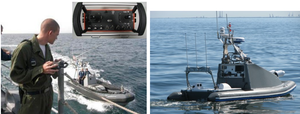
Fig. 3. The manual control of the USV 'Edredon' from a ship's deck [R&D project No. 0 R00 0004 07 documentation]