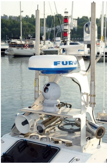
Fig. 2. The arrangement of the navigation devices and communication system antennas on the mast [R&D project No. 0 R00 0004 07 documentation]