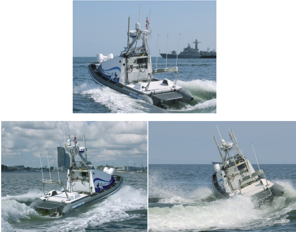
Fig. 1. The unmanned surface vessel 'Edredon' during the sea trials [R&D project No. 0 R00 0004 07 documentation]

The vessel was equipped with the following systems [2–4]: