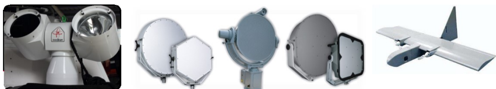
Fig. 4. The vessel equipped with a small caliber machine gun or interchangeably floodlights, a non lethal weapon, an unmanned flying vehicle, etc. [R&D project No. 0 R00 0004 07 documentation]

The vessel's control is carried out from a mobile command post inside a container. Such solution allows applying the vessel in any area of the Polish Coast or a water region, ensuring its high mobility.