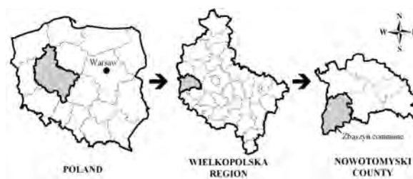
Fig. 1. Location of Zbąszyń commune

Zbąszyń commune is located in the western part of Wielkopolska region and covers 179.99 km 2 (Fig. 1). Most of the area is occupied by forestry – 49.9% of the total commune area. Rural areas cover 39.2% and are dominated by arable land. The rest of the area is covered by built-up areas and urban areas (5.0%), water reservoirs (4.8%), as well as ecological sites and other areas (1.1%).