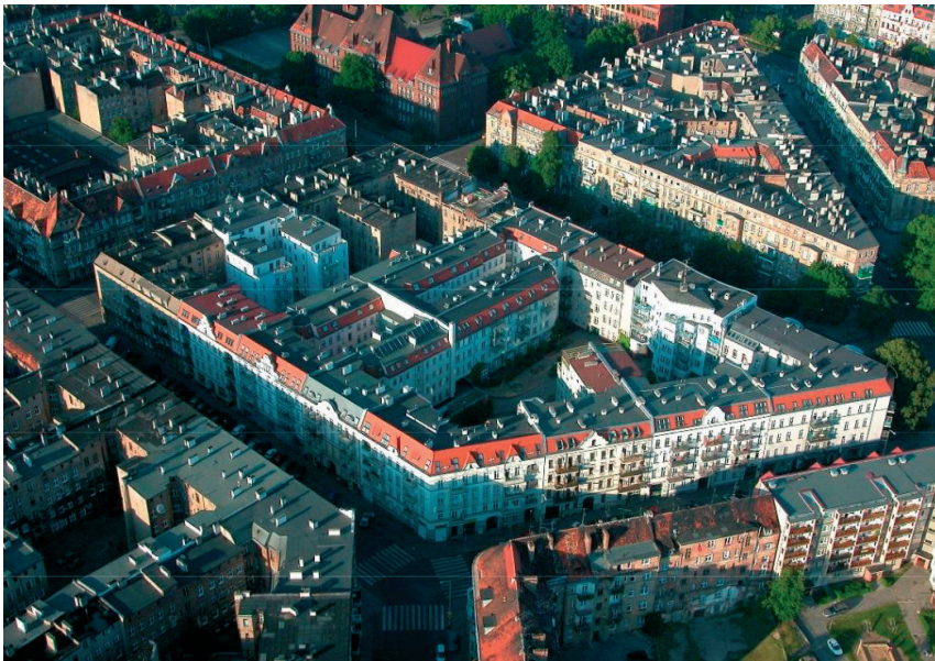
Fig. 2. Aerial view of turzyński quarter number 27, the author: Cezary Skórka

The second example of a comprehensive approach to the issue of revitalization is the document created July 24 th 2007 - the Leipzig Charter on Sustainable European Cities. The Charter was established as a result of the meeting of ministers of the Member States of the European Union on urban development and territorial cohesion.