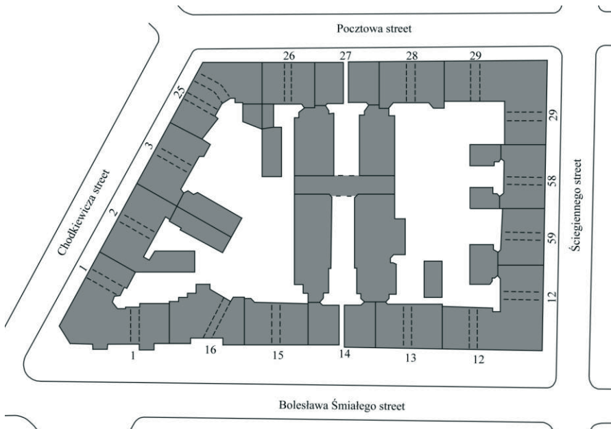
Fig. 1. The plan of turzyński quarter number 27

An example of a successful revitalization process is the city of Szczecin. The basis for all action in the city were created in 1992 as The strategy of renovation the downtown of Szczecin . The program of revitalization of the city assumed the recovery of 56 quarters situated in the historical city center[6]. Due to the complexity of that project, the article will focus on a single example - a pilot restoration of turzyński quarter number 27, which has started in 1993.