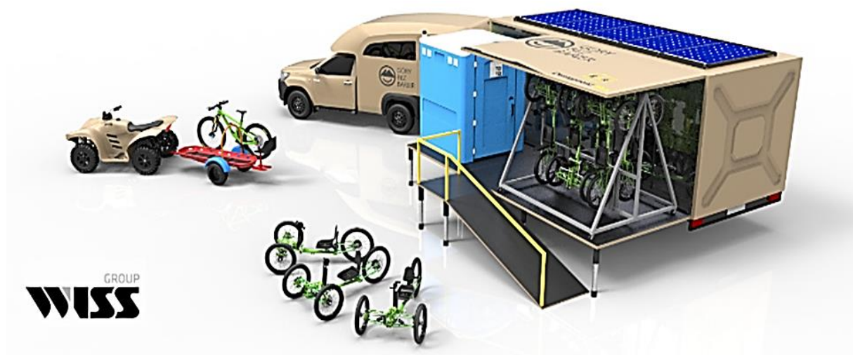
Figure 2. An example of the concept of mobile rentals.

Another assumption of the project is the creation of the idea of creating mobile rental of specialized wheelchairs that allow the implementation of mountain travel on the basis of rental with support for the implementation of the route without incurring the costs of purchasing a specialized wheelchair. The possibility of using the developed solutions of a specialized wheelchair and IT systems of travel support in the field of mountain travel will allow for a significant increase in the accessibility of the tourist offer, and thus the accessibility of disabled people to areas of the non-urbanized environment, the natural environment. An example of the concept of mobile rental companies according to the Borderland Without Barriers Foundation is presented in Figure 2.