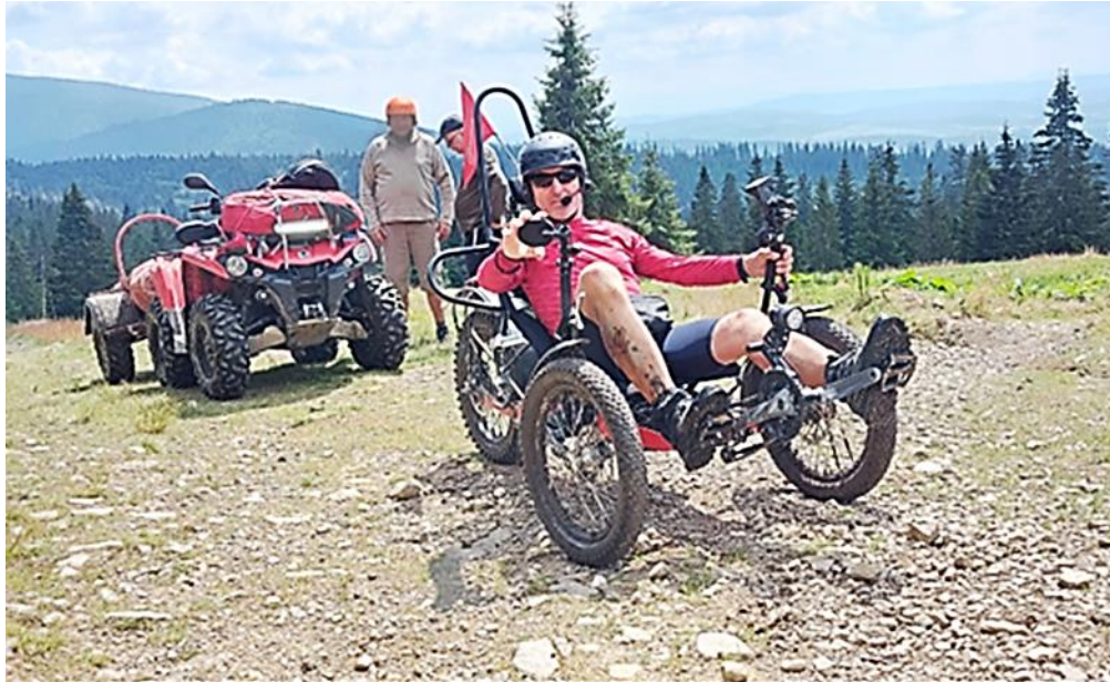
Figure 4. Tests of a three-wheeled vehicle for disabled people on the route at 23-24 July 2022.