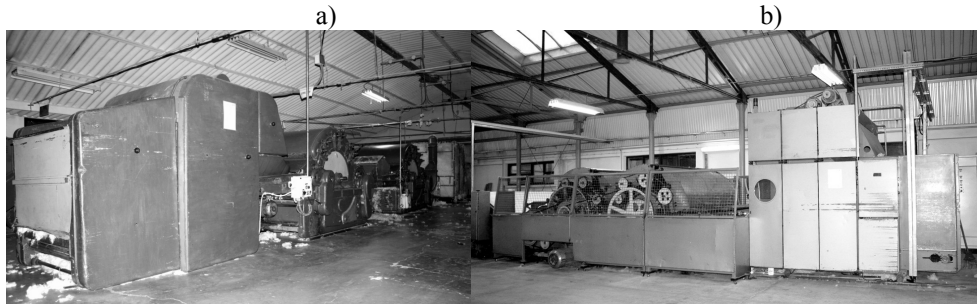
Figure 2. Agricultural textile production process; a – assembly of shear-grinder textile machines and transport cage, b – Textile machine line (feeder and carding machine)