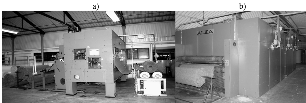
Figure 3. Production process of non-woven fabric; double-plate needling machine, b – non-woven fabric drying machine

Measurement of sound followed with digital sound analyzer DSA-50 with a function of a noise dosimeter. Because a worker during performance of his tasks changes his location, the position of measuring points was specified to be at height of 1.55 \text{ m} \pm 0.075 \text{ m} from the plain, where worker was standing (pursuant to PN-EN ISO 9612:2011). Measurements were made in accordance with 1 method – Measurements for individual activities.