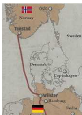
Fig. 1. NordLink power cable [15] Rys. 1. Kabel zasilający NordLink [15]

On the other hand, the carbon dioxide level in the atmosphere decreases during the growth of organic matter, deposition of organic substances in the sediment and during the forming of calcium shells (coral reefs, etc.). It is therefore a natural carbon cycle in nature. Through human activity, its content in the atmosphere rises.