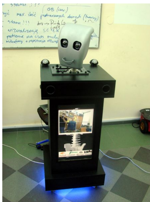
Fig. 3. Social robot Samuel.

This research was supported by Wrocław University of Technology under a statutory grant.