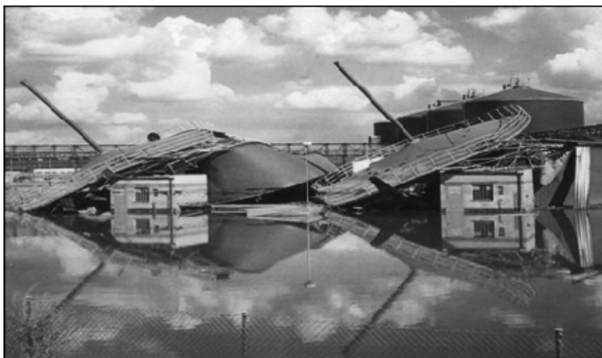
Fig. 2. Technological object destruction cause by flood event [2]