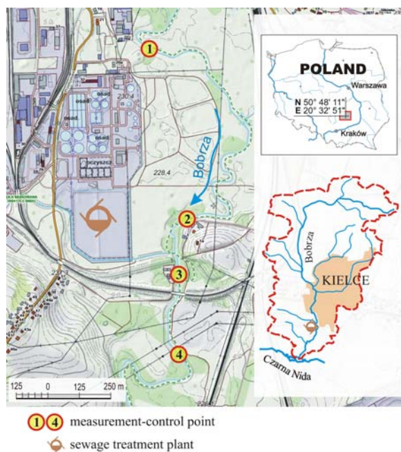
Fig. 1. Location of measurement and control point

The studied section of the Bobrza River catchment is administratively located in Świętokrzyskie province, Kielce county and Sitkówka-Nowiny district, in Wola Murowana (Fig. 1), whereas in terms of physicogeographical region, in the Kielce upland macroregion, within the Świętokrzyskie Mountains mezoregion [KONDRACKI 2013]. The Bobrza River (4 th order) is the right bank tributary to the Czarna Nida, flowing into the Nida River. The spring of the Bobrza River is situated at 370 m a.s.l. The river flows from its source heading west, between Tumlin Hills and Suchedniów-Oblęgorek Landscape Park situated on Suchedniów Plateau, then it forms a gorge through the Oblęgorek Range by Bobrza village and turns to the south. The river forms a next gorge between the Zgórskie Range and Posłowskie Range and flows into the Czarna Nida on the Szydłów Plateau, at the south-eastern edge of Chęciny-Kielce Landscape Park, near Wolica village at 217 m a.s.l. The total Bobrza River length is 50.7 km, average channel slope 3.24‰. The Bobrza headwaters were classified to abiotic type 5 as upland silicate stream with a fine-grained substrate, whereas the analysed river reach from Ciemnica to the its mouth as type 8 upland, silicate-western river [KZGW 2014]. The catchment area to the sewage discharge point from Sitkówka treatment plant is 335 km 2 .