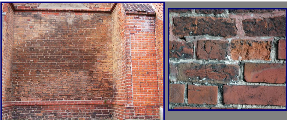
Fig. 4 Brick wall – deteriorated bricks were replaced by the new ones, Chełmno St. Mary Church (J. W. Łukaszewicz)

The development of new technologies has provided new materials, recently even in nano-scale, and gave us at our disposal numerous substances and methods which enable an effective consolidation of disintegrated and weakened stone elements. It allows to preserve the original material to a full extent (Łukaszewicz, 2002). While studying an object prior to commencement of conservation works, one must pay a particular attention to the historical transformations which have been made to the historical monuments for example secondary layers of paint or added architectural details.