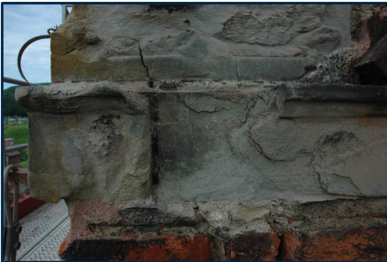
Fig. 2 Gdańsk, sandstone Gotland, architectonic detail - black crusts formed on the stone surface, cracking, peeling off, detached fragments, granular disintegration (J. W. Łukaszewicz)