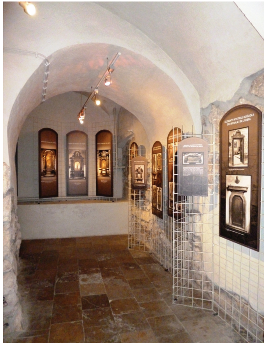
Fig. 6. Part of the exhibition “The history of the building housing the Archaeological Museum in Kraków” (A. Tyniec)