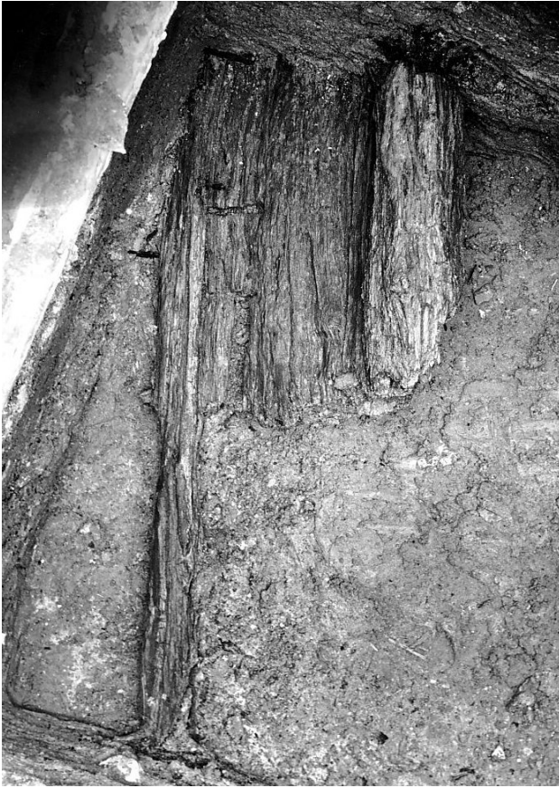
Fig. 2. Fragment of a timber-and-earth embankment. The courtyard of the Archaeological Museum in Kraków, excavation by A. Żaki 1955

During the medieval period the core of the embankment was used as a basis of a stone defensive wall for that part of the city (Radwański 1975: 121–129, 1986).