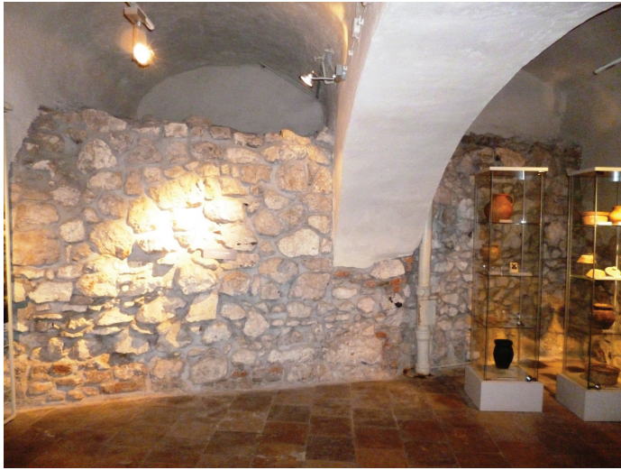
Fig. 5. Part of the exhibition “The history of the building housing the Archaeological Museum in Kraków” – fragment of XIV-century city stone wall (A. Tyniec)