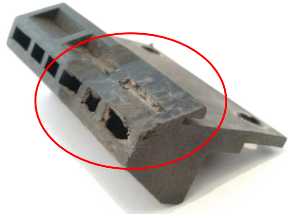
Fig. 3. Traces of wear of the engine cover latch - catch pawl [6]

Rys. 2. Ślady zużycia haczyka zatrzasku pokrywy silnika [6]