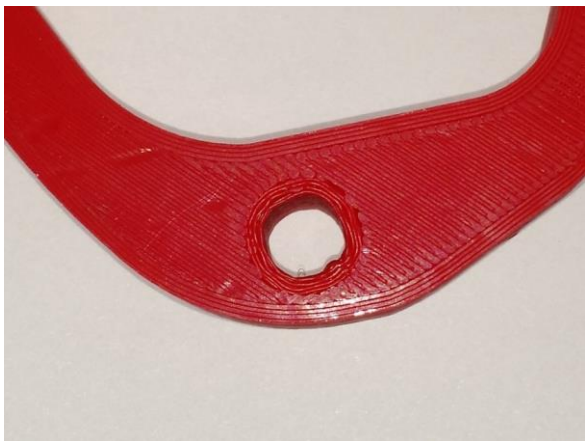
Fig. 4. Shape error of the engine cover latch - catch pawl lever [7]

Analyzing the printed results it was found that the surface of the printed element converted to the STL file does not always reflect the model well. Printing elements have shape errors and visually diverge to a certain extent from those made by the manufacturer using the traditional method. The part is modeling focus on technological and not constructional reasons. It is caused by the complicated construction. Shape errors and manufacturing errors are shown in Fig. 4 and Fig. 5. The element should be designed in terms of use not visual. The visual condition of the received elements will always be different from the original parts.