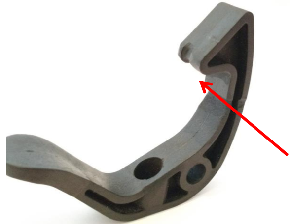
Fig. 2. Traces of wear of the engine cover latch - catch pawl lever [6]

Rys. 1. Ślady zużycia obudowy zatrzasku pokrywy silnika [6]