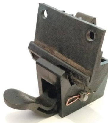
Fig. 6. FENDT 412 Vario tractor engine cover latch element: a) made by 3D printing, b) element originally made by the manufacturer [7]

Rys. 6. Element zatrzasku pokrywy komory silnika ciągnika rolniczego FENDT 412 Vario: a) wydruk 3D, b) element oryginalnie wykonany przez producenta [7]