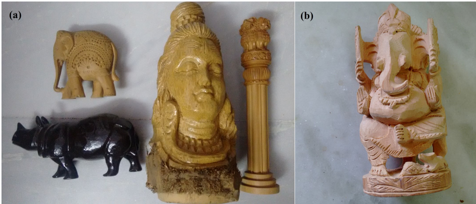
Fig. 1. (a) Finished wood carved craft products; (b) Semi-finished work piece developed in the present study

university Institutional Review Board approved all experimental procedures, and the study received written approval from the workshops prior to their participation in the study.