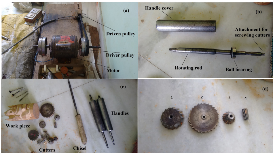
Fig. 2. Physical structure of conventional wood carving tool arrangement. (a) driving motor and pulley arrangement; (b) carving tool handle; (c) various cutters used during carving, chisel, tool handles and a wooden work piece; (d) cutters used for examining HAV during the present study

Based on the anthropometric measurements from the study of Meena et al. [2013] on 160 handicraft workers, the 95 th percentile value of handbreadth at metacarpal was used to calculate the length of the prototype handle [Lewis and Narayan 1993; Das et al. 2005; Dewangan et al. 2008]. Taking, 0.5 cm clearance on both sides, the handle length came out to be 10.8 cm. Less than 5 th percentile value of the inside grip diameter was recommended for the better gripping [Lewis and Narayan 1993; Dewangan et al. 2008]. Therefore, the diameter of the handle was taken as 3.4 cm. Foam rubber sheet of thickness 1.25 cm was used to attain the required diameter of the handle. Foam rubber to metal handle bonding was done using Araldite standard rubber based epoxy adhesive (Resin + Hardener).