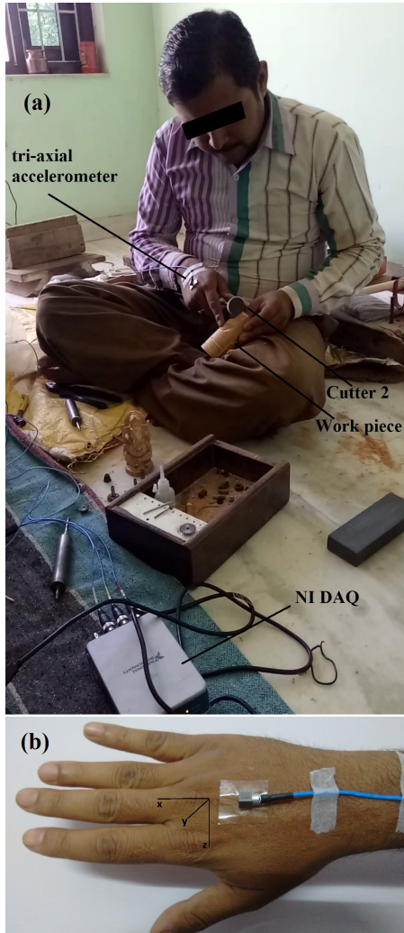
Fig. 3. (a) Typical working posture during carving the wooden specimen; (b) Orientation of accelerometer on workers hand

set perpendicular to the other two axes and directed parallel to the knuckles [ISO 2001] (fig. 3b).