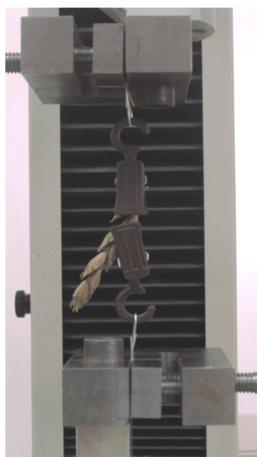
Figure 1. Measurement head of the testing machine MTS Insight 2 with a mounted ear

the scope up to 120 N was applied. Measurements of force values were carried out with precision up to 0.01 N.