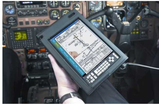
Figure 3. Tablet use in aviation – Jeppesen, 2013

Due to these circumstances current systems used on bridges, especially if they are already installed years ago without substantial updates, are often based on the classic monolithic system architecture which was standard architecture a decade or two ago. The systems are built of individual units, which may or may not be integrated in a "bridge frame". The integration of those systems is often just a matter of exchanging of data streams, but do not really integrate the different components.