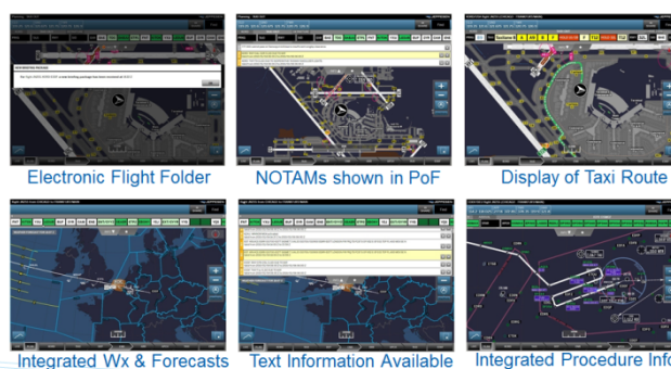
Figure 5. Aviation Apps and situational centric display – Jeppesen, 2013

Looking at the specific situation on a bridge as described above there are benefits if tools are available to the mariner which are providing situational centric information. At the same time the