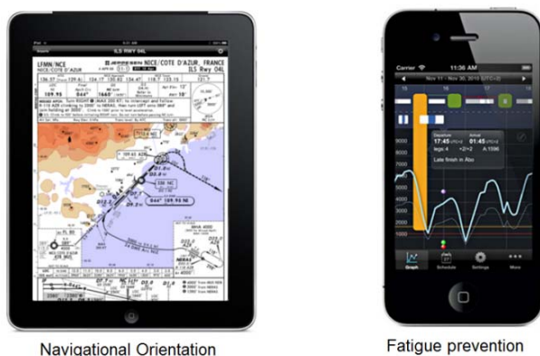
Figure 6. Navigational and Fatigue prevention apps – Jeppesen, 2014