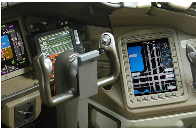
Figure 2. Integrated "Electronic Flight Bag" – Jeppesen, 2012

This certification process not only supports but rather requires long development cycles of new equipment which further leads to a reduction of development speed. Bringing new innovation on the bridge to help improve navigational safety and ship operational efficiency is not in the focus at all. As such the current bridge systems installed are often based on an aged architecture. This becomes even clearer for those knowledgeable of Marine bridge equipment look at other industries, where the use of state of the art systems is common. Figure 2 and 3 show build-in systems as well as the use of a tablet device in modern airline aircraft cockpits.