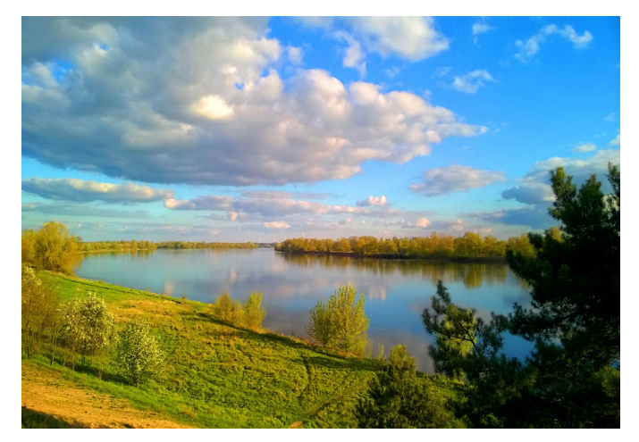
Fig. 2. Wisła at the height of Siarzewo (May 2016)

Apart Siarzewo, the power plants, being situated at the barrages, have the installed discharges 1300 m<sup>3</sup>/s each and they will probably work according to the scheme of sub-peak work.