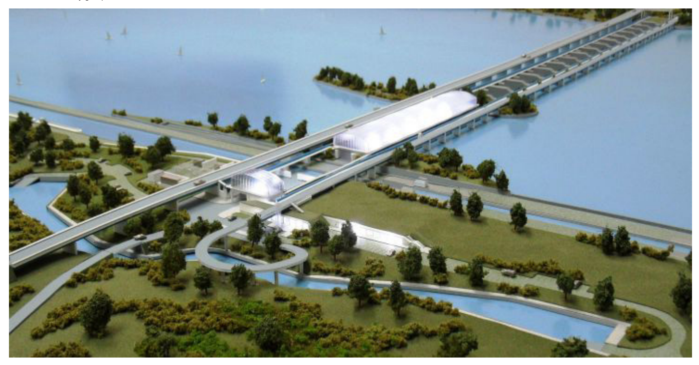
Fig. 3. Energa S.A. investment project in Siarzewo - visualization of the Siarzewo Water Step prepared by Biuro Projektów S.