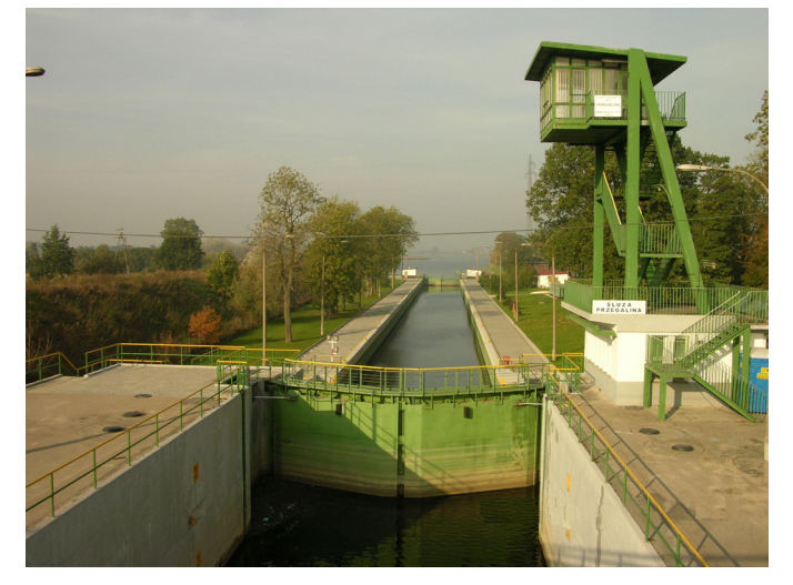
Fig. 5 South Przegalina Lock, view of the upper gate from the water level. Source: www.rzgw.gda.pl

Fig. 4. South Przegalina Lock. Source: www.rzgw.gda.pl