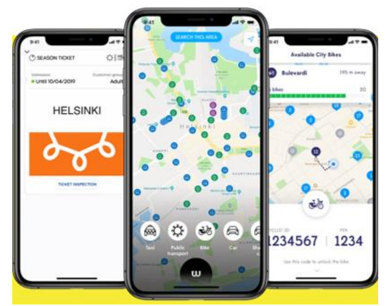
Figure 2.:Whim application for MaaS in Helsinki

Whilst ticketing was initially a mere fare collection tool, it is now considered as an essential enabler of MaaS. The emergence of the MaaS concept has enabled the integration of many new mobility services such as car sharing, bicycle-sharing, car parks, taxis, ride hail services and carpooling with traditional public transport. To get from A to B, travellers have several mobility options, connected to one another, with an open choice of alternatives according to preferences, with multimodal information available at any place and at any time, with easy and unconstrained access and connection from one service to another. Provided it is both accessible and open, contactless ticketing can accelerate the implementation of MaaS, as it offers concrete solutions to facilitate access to all forms of mobility by integrating sustainable development concerns and by influencing modal balance. MaaS has given back to ticketing a major role as the gateway to mobility for all, after having often been wrongly perceived as just a means of paying for transport (Calypso Networks Association, 2019).