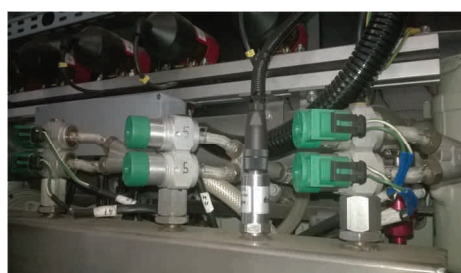
Fig. 3. Post-process gas fuel supply system of 12-cylinder engine

Original spark plugs, recommended by MAN during natural gas supply, were replaced by spark plugs where the spark channel of spark plug was more put out into the combustion chamber. This change has been made on the basis of experimental research and has resulted in a significant improvement of ignition initiation of fuel mixtures. This change was especially important when the engine was powered with a very lean air-gas mixture.