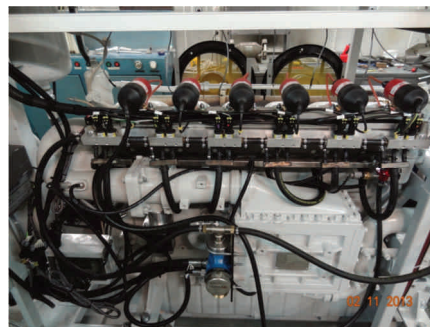
Fig. 2. Ignition system and post-process gas fuel supply system of 6-cylinder engine

equipped. The fuel supply and ignition system of the 6-cylinder engine are shown in Figure 2 and the 12-cylinder engine in Figure 3.