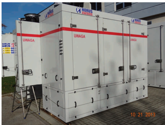
Fig. 1. View of the power-generator set while equipping with elements of the electronically controlled fuel supply system of post-processing gas, in front of the building of Engines Laboratory of Cracow University of Technology

The choice of this unit was resulted mainly due to the fact that MAN offered a 12-cylinder engine with the same geometric cylinder dimensions. Because the research program's assumptions envisaged the development of a single-cylinder power conversion concept, the modular design of the 6-cylinder and 12-cylinder engine fulfilled the stated condition. All elements of the developed concept of electronically controlled post-processing gas injection system as well as the control system itself were made at the Cracow University of Technology. Equipping of the power generators supplied by HORUS-Energia with all the elaborated and made elements of the system was made also here. After these operations, the aggregates were transported to a specially constructed facility, located in one of the "AZOTY S.A." plants. Fig. 1 shows the aggregates in enclosures during equipping with elements of the system in front of the Engines Laboratory of Cracow University of Technology.