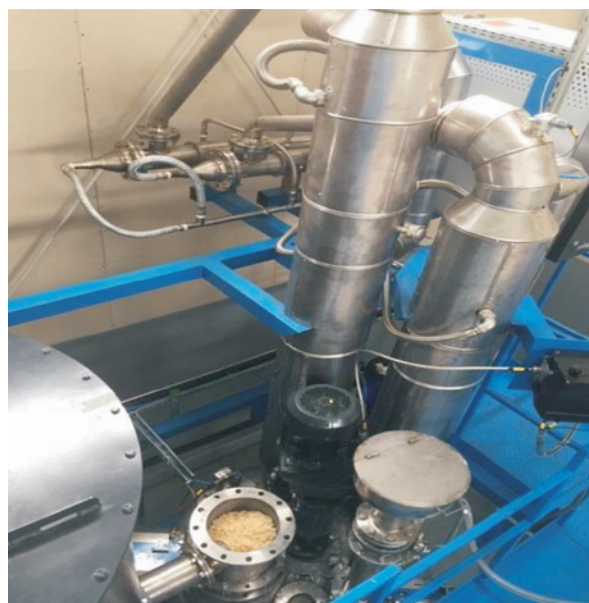
Fig. 1. General view of pilot installation for chemical recycling of PUR