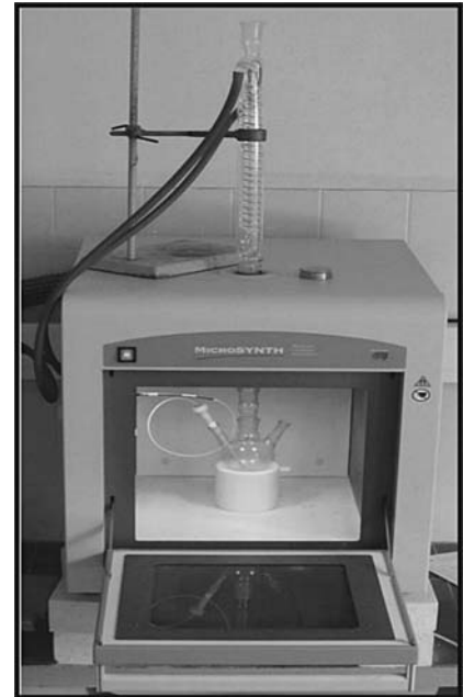
Fig. 3. Laboratory microwave oven Microsynth Rys. 3. Laboratoryjna kuchenka mikrofalowa Microsynth

ment was 10 g and the volume of the leaching agent was 200 ml.