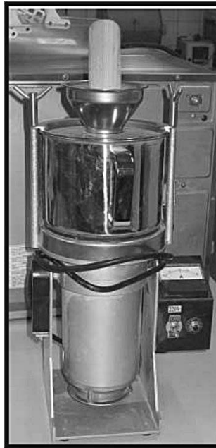
Fig. 2. Grinder MRC Rys. 2. Szlifierka MRC