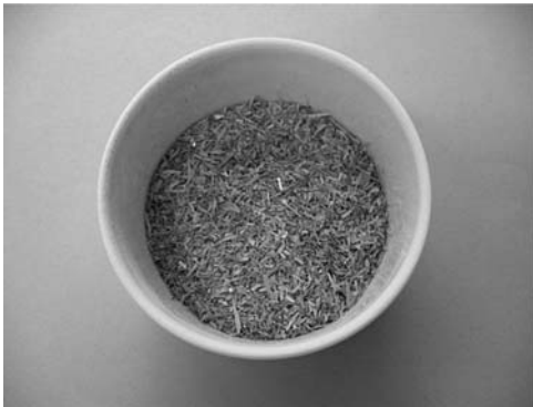
Fig. 1. Straw waste Rys. 1. Odpady słomy