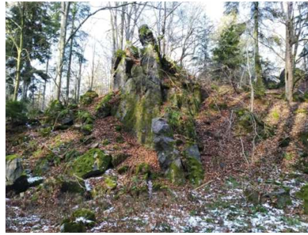
Fig. 5. A typical silicate rock in the Skašov forest Rys. 5. Typowa skała krzemianowa w lesie Skašov