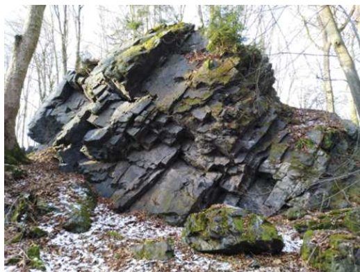
Fig. 1. A rare silicite rock with rough laminar texture Rys. 1. Rzadka skała krzemianowa o szorstkiej warstwowej teksturze