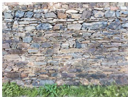
Fig. 3. The wall of residential house, where silicate pieces are combined with adobes. Especially northern walls below slopes had to be reinforced because of abrupt strong floods

Rys. 3. Ściana domu mieszkalnego, gdzie kawałki krzemianu są połączone z cegłą. Zwłaszcza północne ściany poniżej stoków musiały zostać wzmocnione z powodu nagłych, silnych powodzi