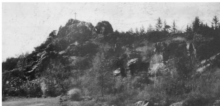
Fig. 8. A rare photo of Kbelnice quarry from the information plate Rys. 8. Unikalne zdjęcie kamieniołomu Kbelnice (z tabliczki informacyjnej)