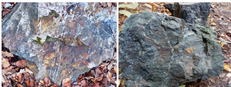
Fig. 2. cracked silicate with secondary quartz (left) and rare flow folds in the same type of stone (right) Rys. 2. Krzemian spękany z wtórnym kwarcem (po lewej) i rzadkimi fałdami płynięcia w tym samym typie kamienia (po prawej)

vergent tectonic processes. The terranes of Cadomian age then become parts of the Cadomian orogeny.