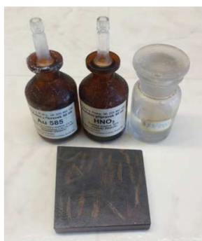
Fig. 4. The piece of touchstone with lines of gold. The stone in the form of finely brushed enables to distinguish gold from common metals and even roughly assess its purity

Rys. 3. Ściana domu mieszkalnego, gdzie kawałki krzemianu są połączone z cegłą. Zwłaszcza północne ściany poniżej stoków musiały zostać wzmocnione z powodu nagłych, silnych powodzi