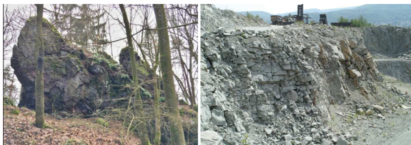
Fig. 10. A compact silicite rock (left). Fissured trachytes in the center of Ústí na Labem (middle) and weathered basalts in the Soutěský quarry near the town of Děčín (right)