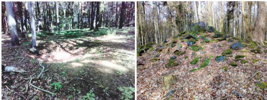
Fig. 7. Remnants of wild digging near Týniště. A typical pit in the forest (left) and debris around one of rocks (right) Rys. 7. Pozostałości "dzikiego" wydobycie w okolicach Týniště. Typowy dół w lesie (po lewej) i gruz wokół jednej ze skał (po prawej)

central part is utilized as the deposit of biomass. At the entrance to the former quarry, a well-preserved concrete pillar of crusher is visible as well as the operational building (now probably a vacation object). The Municipal chronicle of Letiny (Kbelnice forms one of its parts) does not provide any information regarding the quarry. However, it is known that the quarry was utilized very intensively. Recently, the information plate has been installed, providing brief data of general character, unfortunately without any geological features (Figs. 8,9).