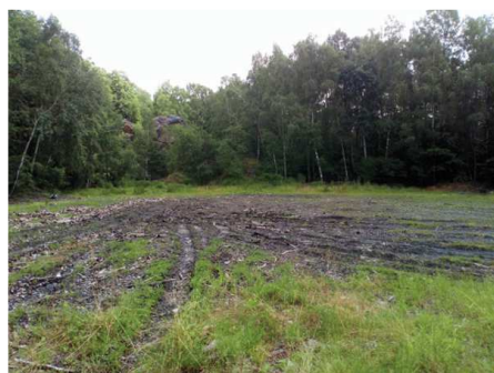
Fig. 9. The former quarry and its present day situation Rys. 9. Dawny kamieniołom i jego obecna sytuacja