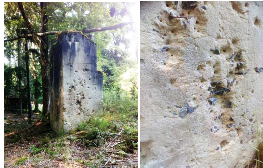
Fig. 6. The pillar of former stone crusher and its detail Rys. 6. Fundament dawnej kruszarki kamienia i jego detal