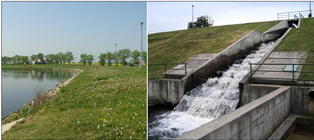
Figure 2. Part of the earth dam and spillway of the Mściwojów Reservoir

ervoir sediments was not high, and the content of heavy metals remained in the range of the 1 st and 2 nd class of water purity. Moreover, the study confirmed that the sediment tank and pre-reservoir were effective in retaining the fine fraction of sediments [Wiatkowski 2006, Wiatkowski and Kasperek 2008]. Mokwa and Pikul [2006] analysed the influence of immersed plants on the concentration of the suspended sediments, confirming their beneficial influence on the deposition of sediments in the tank.