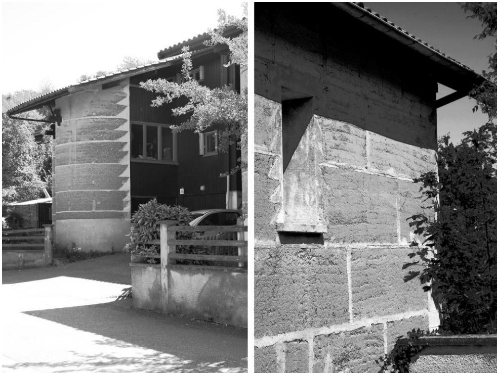
Fig. 5. Îlot 5 – Islet 5, architect: Jean-Vincent BERLOTTIER. A house with four apartments built of compacted earth imitating dried adobe bricks. Wall thickness from 50 cm to 40 cm on the upper floors. The northern facade with cylindrical blocks housing pantries and cellars, the southern facade with glazing in the living room ensuring passive recovery of solar energy. In houses, thermoregulation is carried out by the inertia of earthen floors

After almost 40 years, you can observe good aging of the earth walls. Material deterioration was not observed. The thermal performance remains unchanged from the outset.