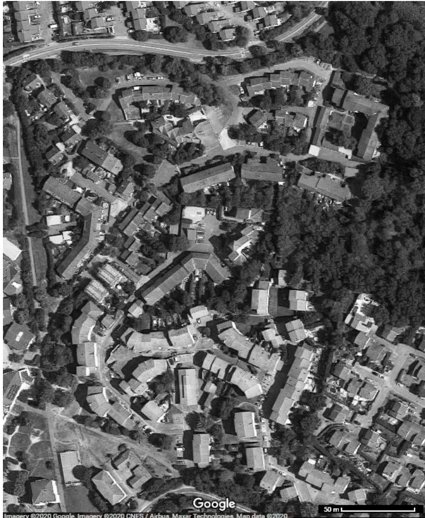
Fig. 2. A satellite image from the Google Earth application showing irregular, plenty of the characteristic urban interiors inside the habitat's urban structure

in Villefontaine is a unique operation known as a site for experimenting with various earth-building techniques in the early 1980s.