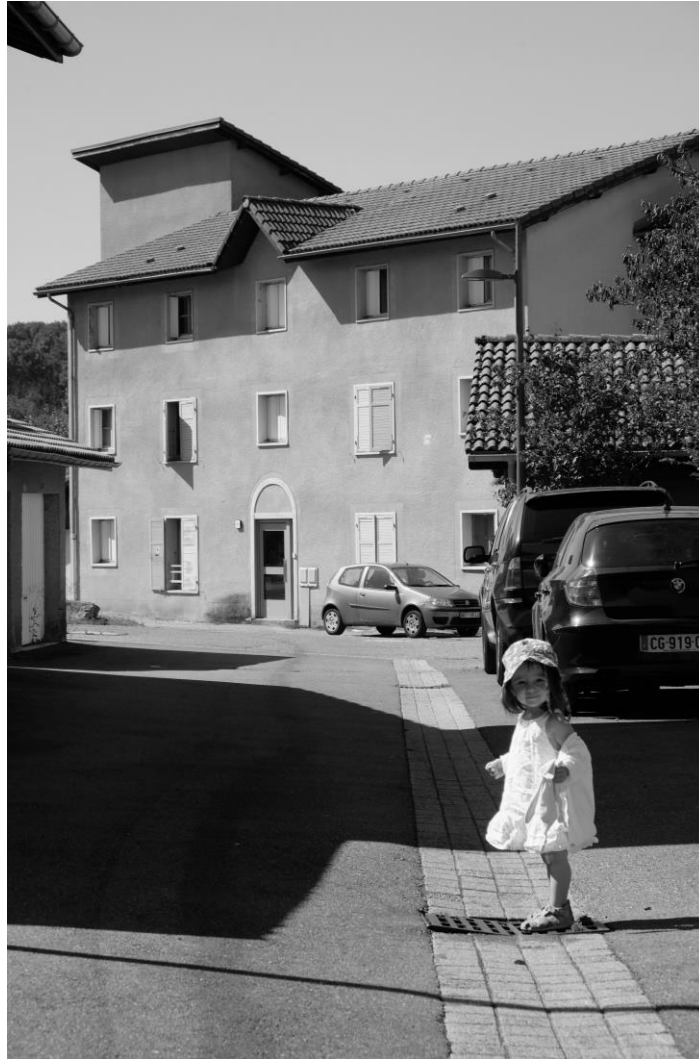
Fig. 1. Street of the Fougères district where it was built a social housing estate built of clay

ly abandoned for decades, has become the building blocks of diverse, experimental projects. Compacted, stabilized and reinforced soil are implemented around these bioclimatic implementations.