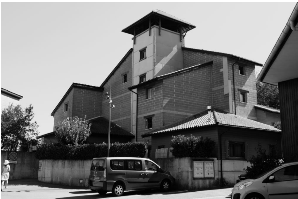
Fig. 14. Islet 3 has become a recognizable symbol of the place

Le Domaine de la Terre tower appears as an emblem in the administrative documents of the town of Villefontaine. Thus, the architectural silhouette acquired the meaning of a landmark.