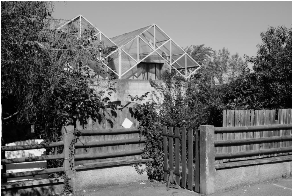
Fig. 8. Architecture and greenery merge with each other throughout the estate