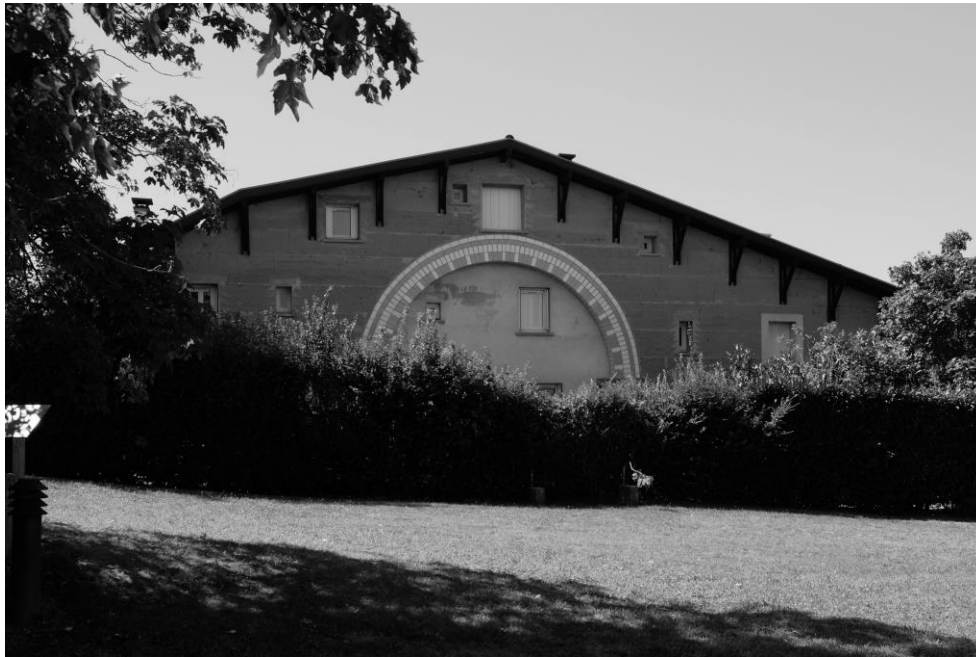
Fig. 4. Îlot 8 – Islet 8, architects: Jean-Michel SAVIGNAT, Odile PERREAU HAMBURGER, M. MUNTEANU. The property consists of two parts with 6 apartments. Covered with a gable roof, it is a synthesis of vernacular architecture and contemporary form. The silhouette of the building resembles a cat's back. The object is made of dried adobe bricks forming a 45 cm wall

understand the architectural features and values of heritage, and then to define its potential useful in many areas, also in the process of creating and implementing architectural projects, and in this case also urban, rural, etc.