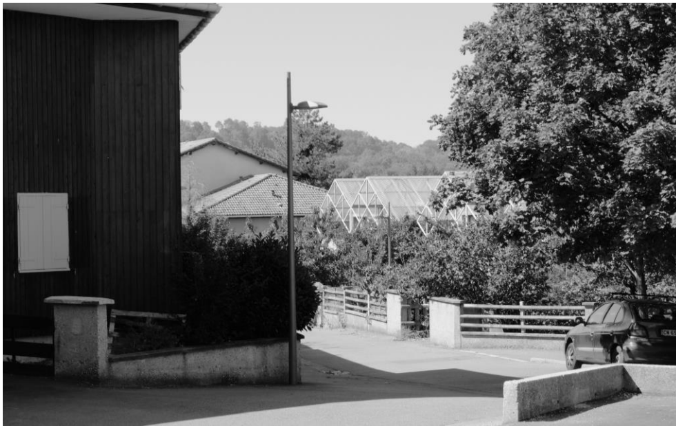
Fig. 10. The neighborhood pedestrian and driving routes are characterized by introductory, guiding and stopping elements. This proves the rich urban structure of this place

This naturalistic network of residential buildings has many features in common with the centers that develop under construction arbitrariness. The streets meander between houses, thereby overcoming considerable differences in the height of the terrain. The numerous guiding elements put the passer-by in a walking mood, the journey becomes a free walk among this specific architecture of the earth village.