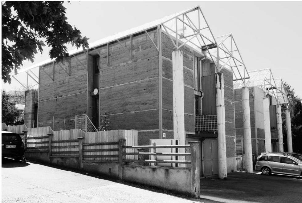
Fig. 9. Îlot 1 – Islet 1, architects: Françoise JOURDA and Gilles PERRAUDIN. This characteristic building contains 4 apartments in a compact block, which, together with insulation from compacted earth, ensures a minimum level of energy losses. The resulting lumps, fastened with steel frames, adopt the features of the surrounding agricultural sheds through their weight and architectural expression. The principle of a thick, double-skinned façade allows for the organization of buffer spaces and terrace structures adapted to the conditions of sunlight and air conditioning

The geographic and topographic location makes the estate unique. Natural factors to which a person has to adapt influence the rich, varied architectural and urban shape of the space. Diverse architecture in the spirit of postmodernism, built from native materials, in its form imitates the local solutions from the Dauphinoise region, where 80% of houses built before 1950 were in adobe technology (the name of adobe technology is common to languages derived from Latin), i.e. dried brick also known as “raw earth”. It is therefore a great reference to the tradition of the region.