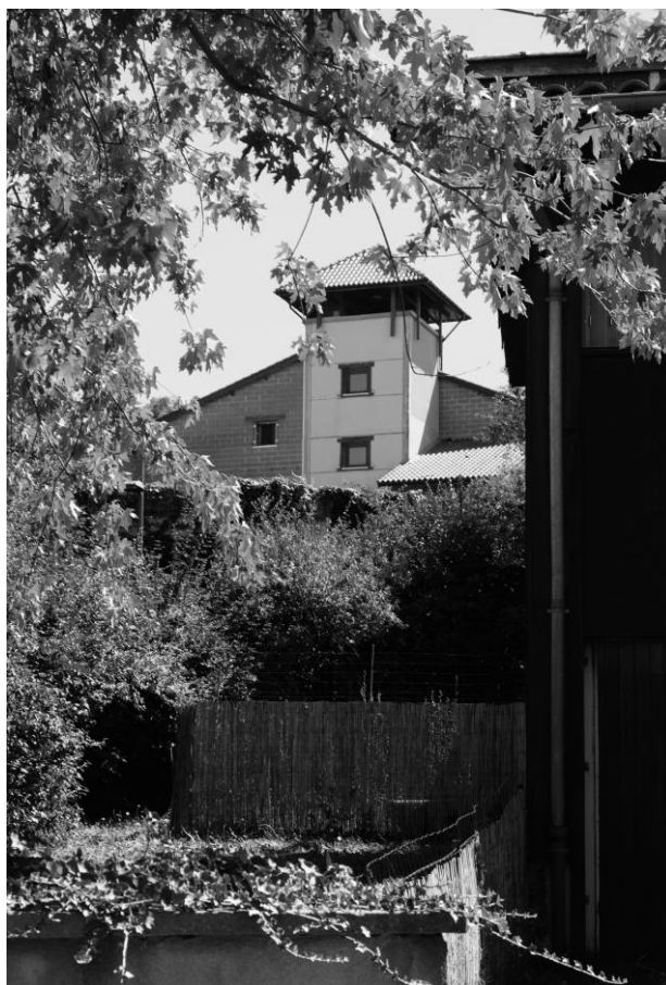
Fig. 13. Îlot 3 – Islet 3, Architect: Jean-Vincent BERLOTTIER; Six apartment blocks are arranged around a 15-meter tower. Each house consists of two parts: a core of adobe blocks made of dried clay and a wooden block containing a living room and a bedroom on the entresole

The dominant feature is the tower, the place of exhibition and cultural animation. This is a village earth tower designed on the central island by architect Jean-Vincent Berlottier to show the possibilities of the material. The fifth floor is open on all four sides and thus offers a small vantage point. It allows for a breathtaking view of the panorama of the city and the region.