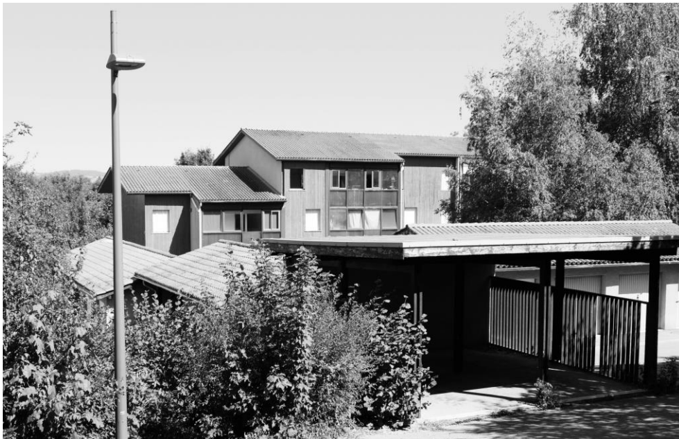
Fig. 6. The architecture of the estate is consistent with the mountainous landscape of the region

The earth estate is located in the Rhône-Alpes region. A characteristic feature of the centers in this region is the horizon line drawn with the peaks of the mountain ranges surrounding the Lyon agglomeration.