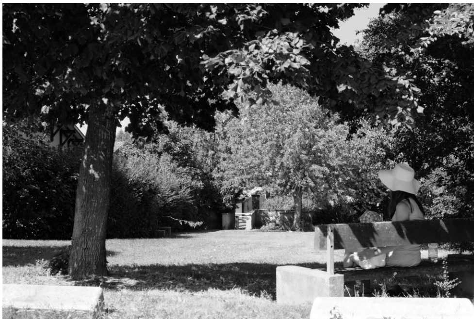
Fig. 12. Green spaces are themselves Domaine de la Terre – the domain of the earth