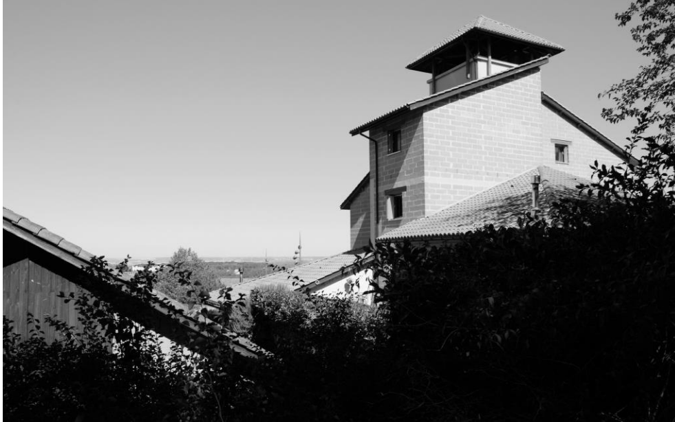
Fig. 7. Masses of earth buildings imitate in their form traditional forms practiced by generations since the times of the first habitats in the region