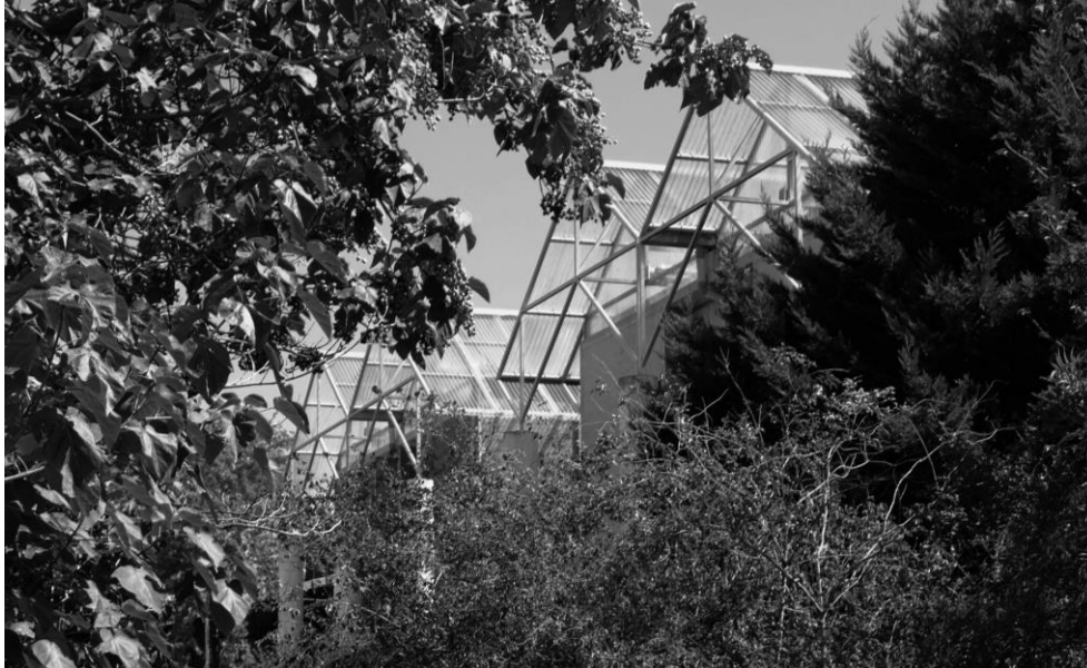
Fig. 11. The characteristic light-constructed peaks of Islet 1 are visible from many places of the complex. They are an excellent landmark that gives way only to a dominant with an unobtrusive form