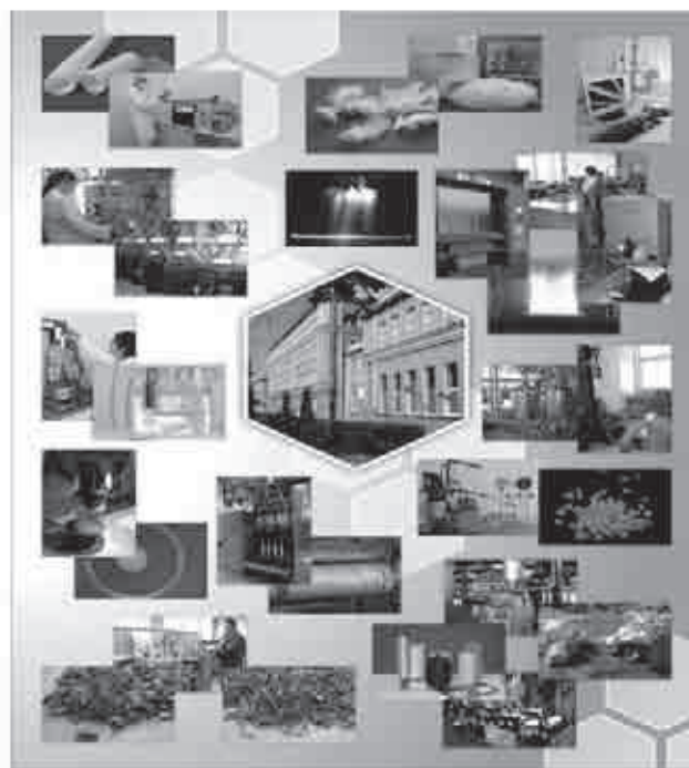
Fig. 2. The Institute's research infrastructure

Insufficiently purified waste water poses an even more serious threat to the environment waters. Durable, resistant to biological degradation substances, primarily lignin compounds, may appear in the sewage. The Institute strives to render the burden harmless. Cooperation in the field is established with Stora Enso Poland and Packprofil, Kolonowskie.