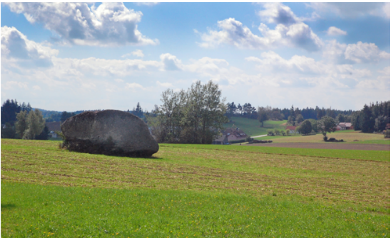
Fig. 2. Rolling countryside of northern Waldviertel, near Haugschlag. Note large granite boulders exposed due to erosion of weathering mantles, photo P. Migoń • Falisty krajobraz północnej części Waldviertel koło Haugschlag. Uwagę zwracają duże granitowe bloki odsłonięte wskutek usunięcia pokrywy zwietrzelinowej, fot. P. Migoń

From a large population of tors in Waldviertel a sample of 15 individual localities has been selected and is characterized in detail. These tors either best represent the diversity of granite residual rock formations in the region, or are