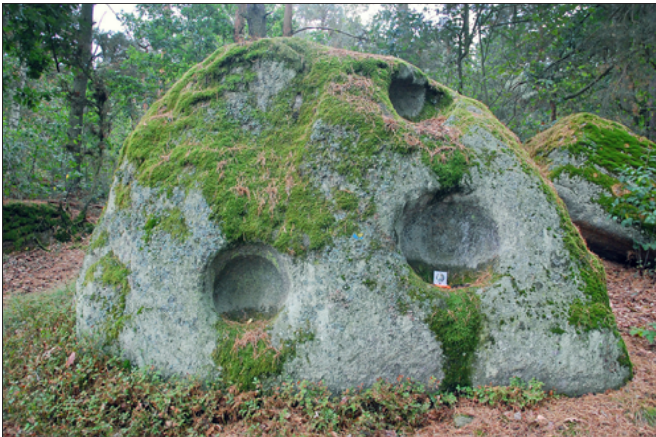
Fig. 19. Weathering pits on a rotated granite block of Dreilöcherstein, photo P. Migoń • Kociołki wietrzeniowe na obróconym bloku granitowym Dreilöcherstein, fot. P. Migoń

Nearly all tors described in this paper are located next to marked trails, with the exception of Gugelhupfstein and Geyersteine. Access to both these sites is, however, easy due to the presence of forest paths, although no signposting indicating the way to them exists. Best accessible is the protected terrain of Blockheide, characterized by particularly high density of marked paths which allow to reach all interesting rock formations in the area. Blockheide has long been a favourite outdoor recreation ground for the town of Gmünd and numerous tors and boulders add to its appeal. Likewise, forest grounds to the east of Heidenreichstein, where the Hängender Stein tor is located, have been developed into a recreation area. The distance from nearest roads varies but is generally small and walks no longer than 20 minutes are required to reach the tors. In several cases only a few minutes walks are necessary (e.g. Dreilöcherstein, Wackelstein near Amaliendorf, Gugelhupfstein). The only exception among the sites considered here are tors in the vicinity of Kautzen which can be reached in about 45 minutes. However, designated parking is not everywhere present. Whilst most tors are in natural state, two most elevated mountain-top locations, i.e. Nebelstein and Mandlstein, have been specially developed for tourism. Access to their upper parts required trail engineering and viewing platforms with handrails have been erected.