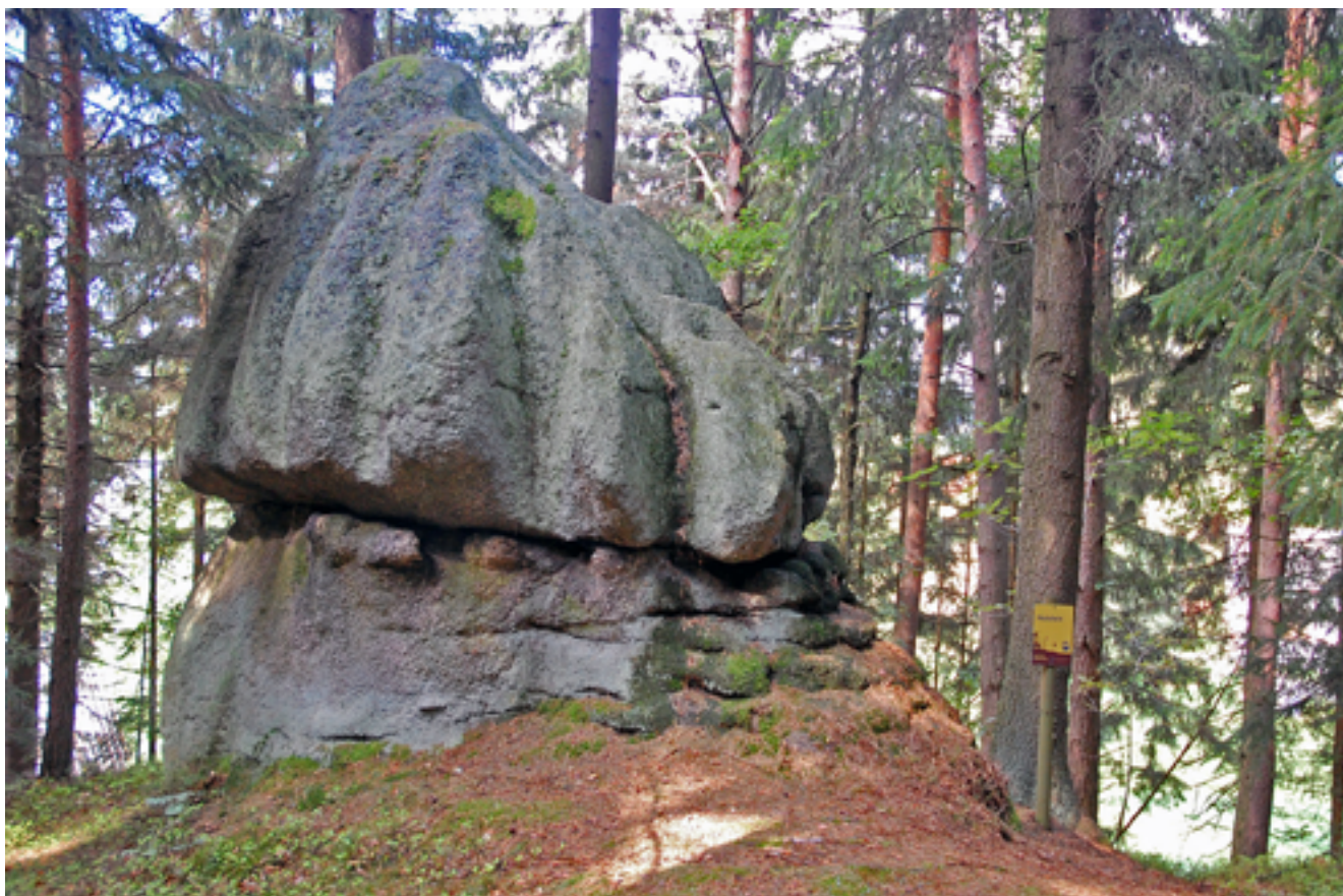
Fig. 12. Karren on Hutstein • Żłobki na skałce Hutstein

by numerous karren which in conjunction with parallel ribs create distinct surface micromorphology. The deepest karren are on the east side of Hutstein, with some continuing on the surface of the lower part of the form – the pedestal, but these are poorly developed. Minor weathering forms of Hutstein, not yet overgrown (as in the case of Gugelhupfstein), are considered among the best example of granite karren in the region (Huber, 1999). The tor is hidden in the forest, but access is signposted. There is a small plaque next to Hutstein indicating its name.