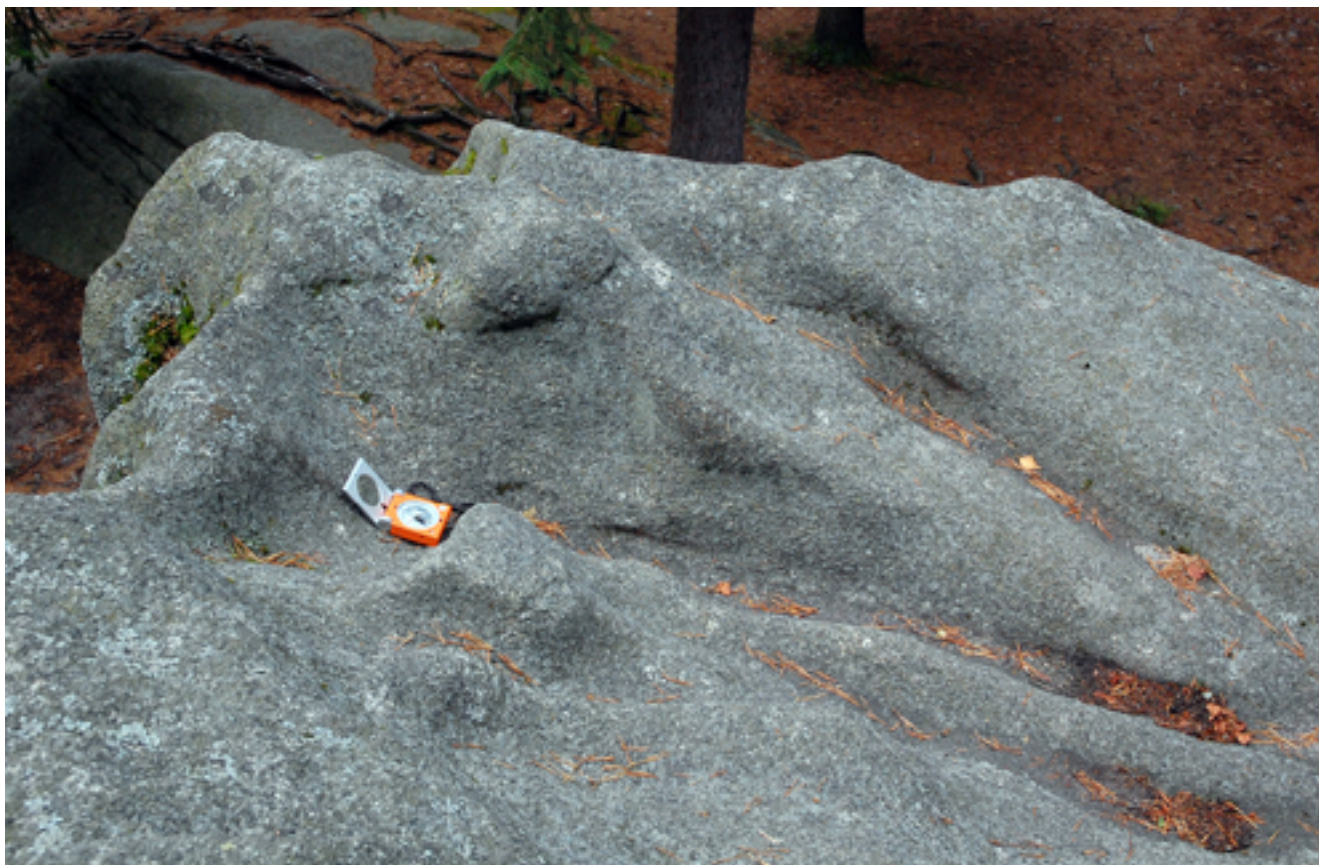
Fig. 9. Dendritic pattern of rills on the upper surface of Hängender Stein • Dendrytyczny układ rynienek na górnej powierzchni Hängender Stein

Geyersteine consist of three ‘mushroom’ rocks whose caps once formed a continuous massive slab more than 2.5 m thick (Fig. 10). Granite below is densely parted by horizontal joints, whilst the upper slab is divided into separate residuals along SSW–NNE vertical joints. The upper edges of all boulders building the form are rounded and their surfaces are diversified by karren covered by mosses. Elevation difference between the top of the tor and the valley bottom is c. 9 m. The valley floor, more than 20 m wide, is made of densely packed boulders, most probably exposed through preferential fluvial erosion of loose regolith. The tor group of Geyersteine has been described as a residual landform resulting from long-term etchplanation processes (Chábera, Huber, 1995).