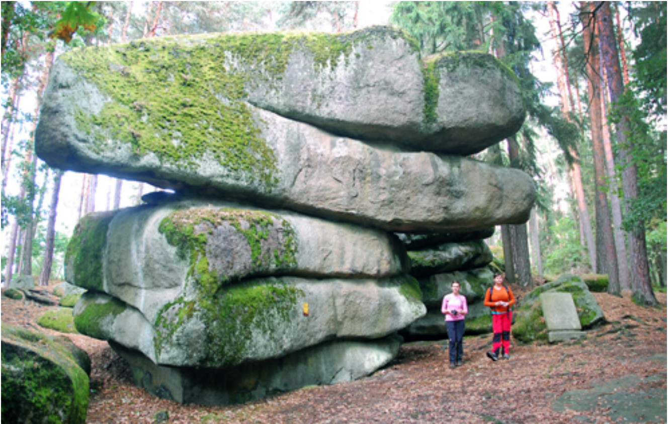
Fig. 4. The shape of Christophorusstein is related to the presence of thick slabs of massive granite • Kształt Christophorusstein nawiązuje do obecności grubych płyt masywnego granitu