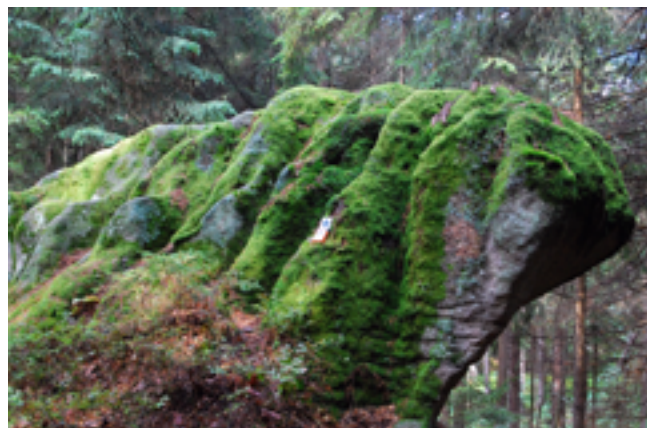
Fig. 11. Moss-overgrown karren of Gugelhupfstein, photo P. Migoń • Pokryte mchem żłobki na skałce Gugelhupfstein, fot. P. Migoń

Nevertheless, the outcrop has been described in scientific publications and is considered as one of the finest examples of granite karren and flared slopes in the region (Huber, Chábera, 1993, 1994; Huber, 1999).