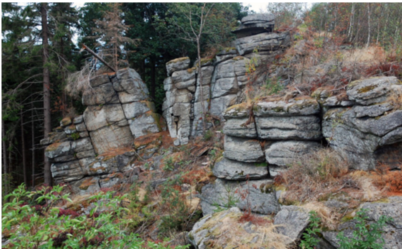
Fig. 16. Rock crags at Nebelstein. Note their angular outlines and the evidence of gravitational displacements due to slow joint opening, photo P. Migoń • Urwiska skalne pod szczytem Nebelstein. Uwagę zwracają ich kanciaste zarysy oraz ślady przemieszczeń grawitacyjnych związanych z powolnym otwieraniem się spękań, fot. P. Migoń