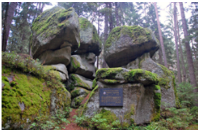
Fig. 10. Rock formations of Geyersteine • Formacje skalne Geyersteine