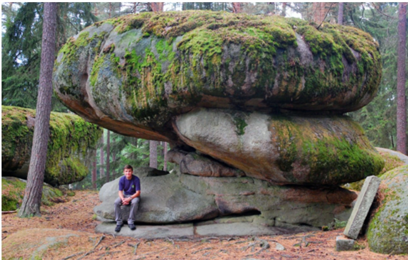
Fig. 3. Pilzstein, with a large overhang on the western side • Pilzstein ze znacznych rozmiarów przewieszka od strony zachodniej

Wackelsteine. Among the highlights of Blockheide are several perched boulders resting on rock platforms, which show (or showed) ability to move and are called Wackelsteine (Chábera, Huber, 1995). The largest balanced rock, located in the southern part of the area, close to Christophorusstein, is 9.3 m long and reaches 2.5 m high (Fig. 6).