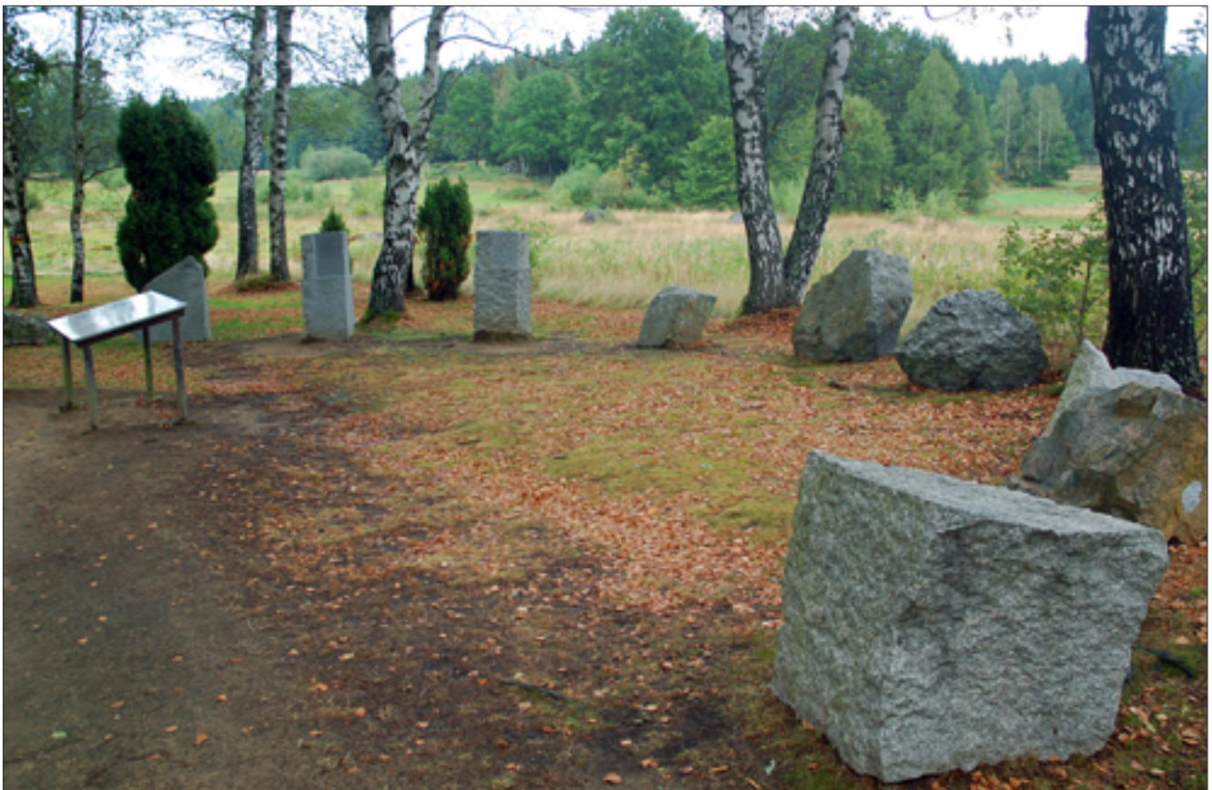
Fig. 21. Examples of granite rocks at the open-air geological exhibition in Blockheide • Przykłady skał granitowych pokazane na ekspozycji geologicznej na wolnym powietrzu w Blockheide

so-called Lutherische Kirche – once the largest granite monolith in the area, completely excavated for building stones. The geological exhibition, in turn, shows more than 30 rock specimens assembled in five genetic groups, with granites as one of them (Fig. 21).