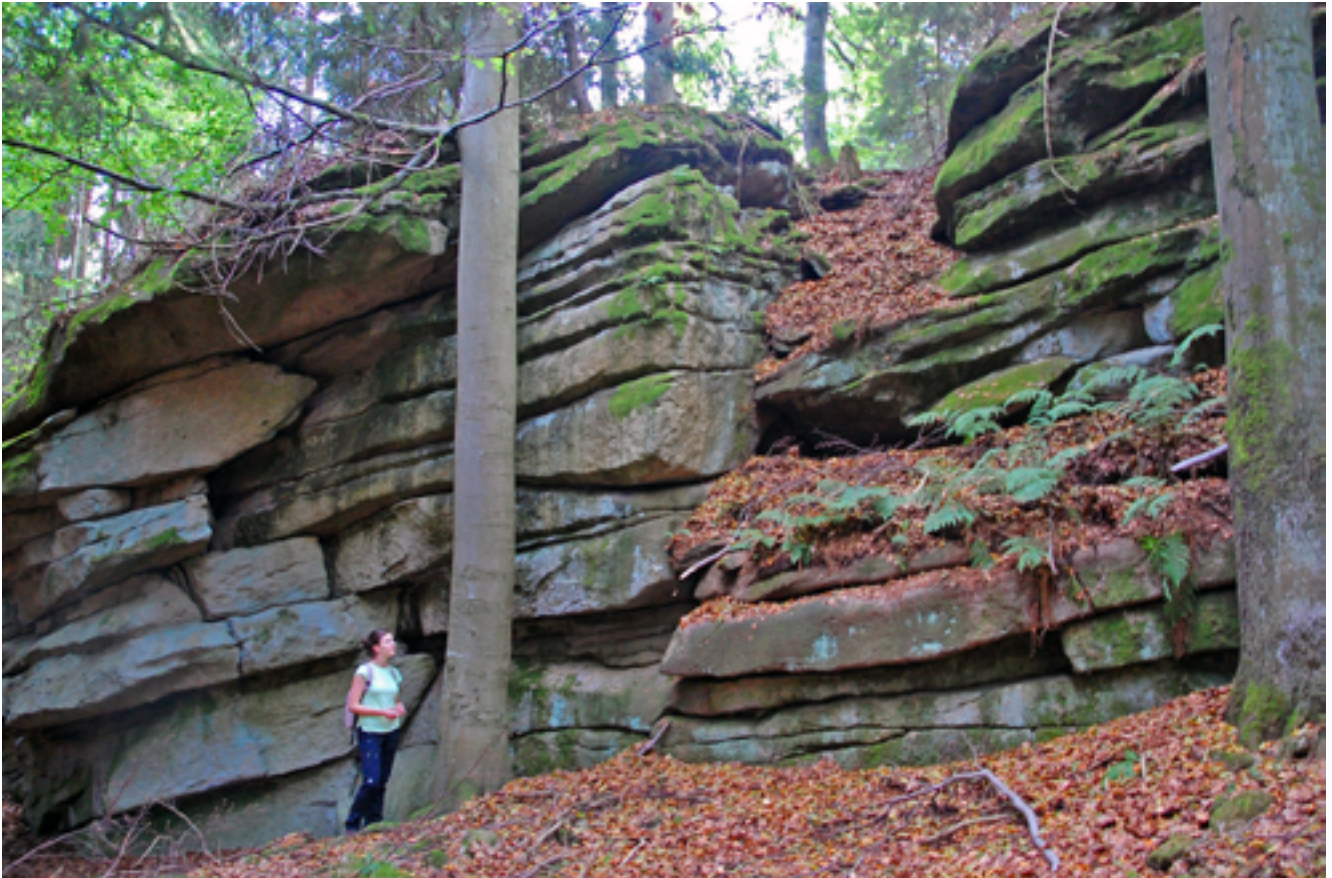
Fig. 14. Rock cliff below the summit surface of Hoher Stein • Klif skalny poniżej powierzchni szczytowej Hoher Stein