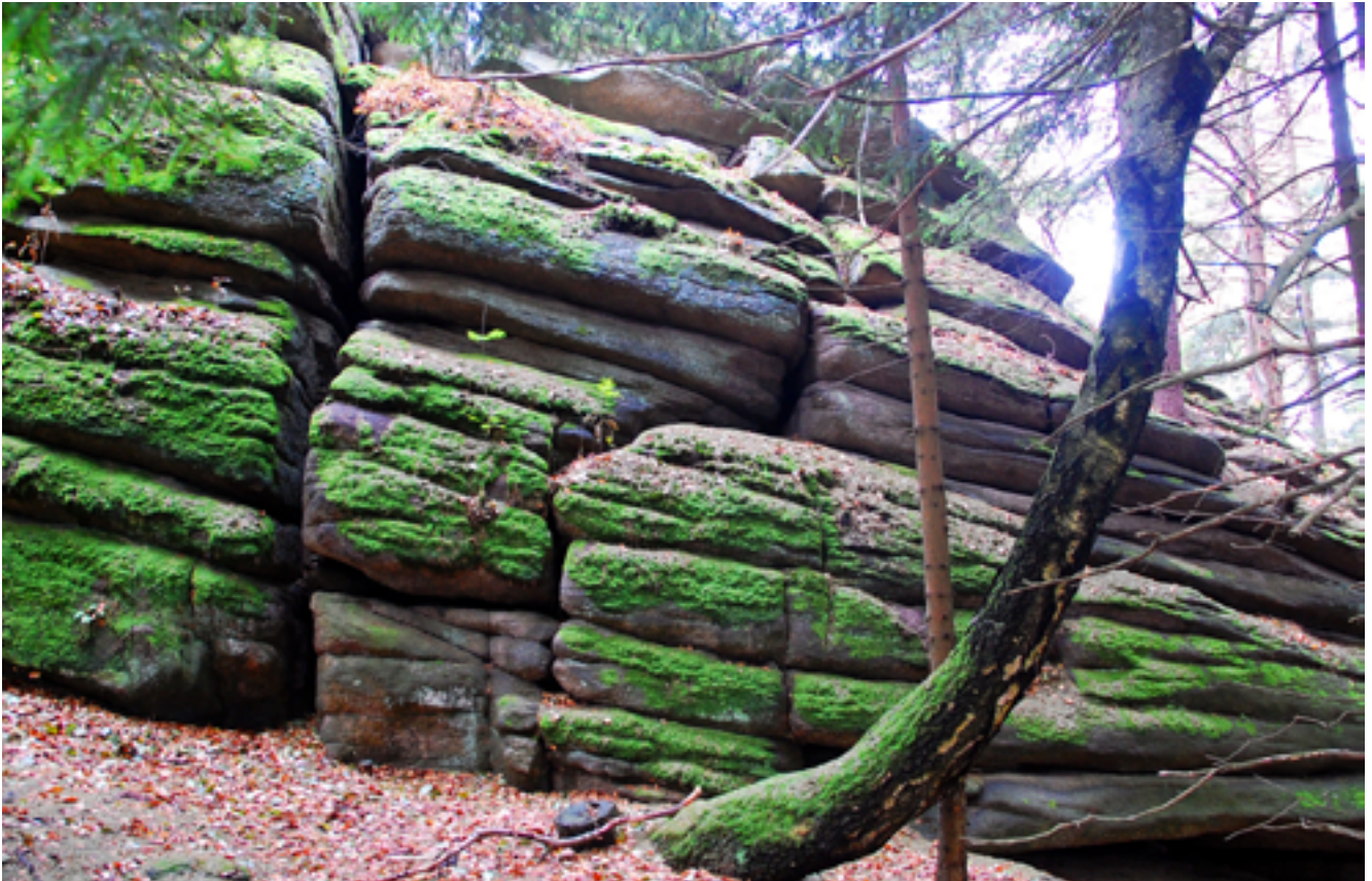
Fig. 17. Pseudobedding at Mandlstein • Pseudowarstwowanie na skałce Mandlstein