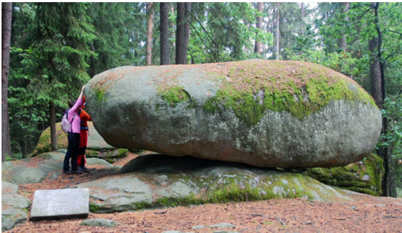
Fig. 6. Wackelstein II is the best example of balanced rock in Blockheide, photo P. Migoń • Wackelstein II jest najlepszym przykładem chybotka w Blockheide, fot. P. Migoń.

A large elongated rounded boulder lies on an upward-convex platform, slightly protruding from the ground. The length of the pedestal is 7.3 m. The upper boulder is massive and bare, only partially covered by mosses in the top part. In contrast to the nearby Christophorusstein no specific microrelief typifies its surface, which is probably related to boulder instability, unfavourable for localized higher efficacy of weathering. The site is easily accessible and well signposted, located next to the GRANITkulTOUR trail. The name of the rock group has been carved in a stone-made board placed near the site, but otherwise no further explanation or interpretation is offered. Two other balanced rocks, both of smaller dimensions, are present in the eastern part of the area and signposted.