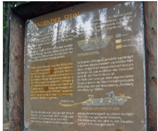
Fig. 20. Interpretation panel next to Hängender Stein to explain the two-phase origin of tors • Tablica objaśniająca dwuetapowe powstawanie skałek granitowych przy skałce Hängender Stein

Tourist infrastructure is best developed at Blockheide and includes an information centre, an extensive network of marked trails, two thematic trails, and an open-air geological exhibition. Whilst one of the trails is focused on biology, and specifically on biotope diversity and food chains, the other one, called GRANITkulTOUR, explores the use of granite and methods of stoneworking in the past and at present. Occasionally, historical information is provided, e.g. about the