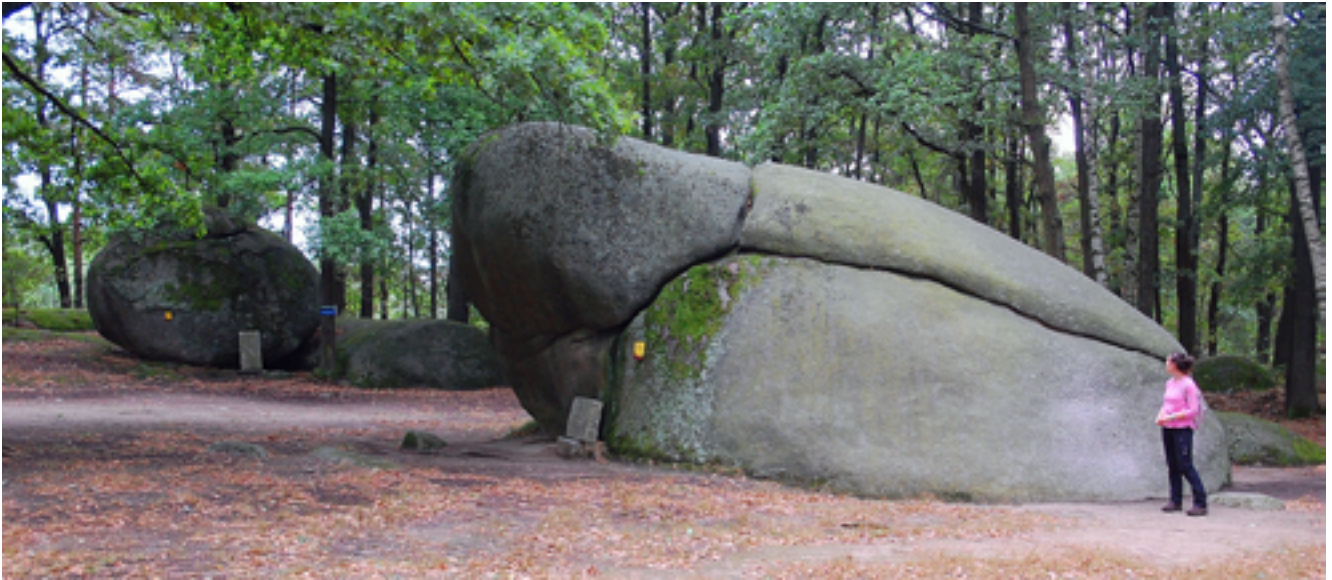
Fig. 7. Teufelsbett (right) and Teufelsbrotlaib (left, in the background), photo P. Migoń • Teufelsbett (po prawej) and Teufelsbrotlaib (w tle po lewej), fot. P. Migoń

The upper part of the boulder is hemispherical and has smooth outer surface, except for the series of small notches hollowed in one side of the block. In the vicinity of Wackelstein other interesting boulders are located. Next to the balanced rock large, massive compartments with well-developed weathering pits, some as long as 1.5 m, occur. Furthermore, lower sides of certain blocks show classic basal concavities, known as flared slopes and indicative of shallow subsurface weathering, some up to 10 m long and 0.5 m high. A rare phenomenon, with a few equivalents elsewhere, is a pair of flared slopes on two adjacent boulders facing each other and separated by an open cleft (Fig. 8). In addition, rock outcrops near Amaliendorf show signs of quarrying, both in the form of stone quarries as well as split boulders.