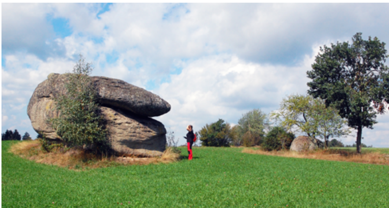
Fig. 13. Large granite boulders and exposed rock platforms in open terrain east of Haugschlag • Wielkie bloki granitowe i platformy skalne na otwartej przestrzeni na wschód od Haugschlag

There are three marked trails in the vicinity of tors, with signposted directions to the cliffs. However, no other tourist infrastructure exists at the site, nor is an information panel present. Although the cliffs are in forested terrain, they are reasonably well exposed. In regional literature they have been described as examples of frost-riven cliffs, i.e. denudational landforms causally related to the Pleistocene periglacial environment (Chábera, Huber, 1999).