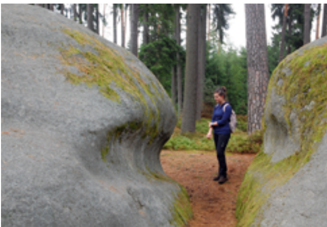
Fig. 8. A pair of flared slopes along a widened joint-controlled defile between two granite outcrops, near Amaliendorf, photo P. Migoń • Para nisz kłoszowych wykształconych wzdłuż poszerzonej szczeliny pomiędzy dwiema wychodniami granitu, w pobliżu Amaliendorf, fot. P. Migoń

The upper part of the boulder is hemispherical and has smooth outer surface, except for the series of small notches hollowed in one side of the block. In the vicinity of Wackelstein other interesting boulders are located. Next to the balanced rock large, massive compartments with well-developed weathering pits, some as long as 1.5 m, occur. Furthermore, lower sides of certain blocks show classic basal concavities, known as flared slopes and indicative of shallow subsurface weathering, some up to 10 m long and 0.5 m high. A rare phenomenon, with a few equivalents elsewhere, is a pair of flared slopes on two adjacent boulders facing each other and separated by an open cleft (Fig. 8). In addition, rock outcrops near Amaliendorf show signs of quarrying, both in the form of stone quarries as well as split boulders.