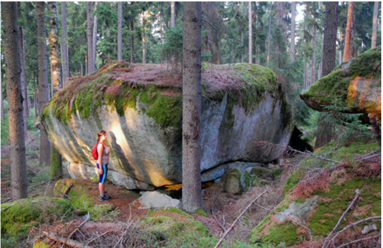
Fig. 15. Teufelsstein is a huge granite monolith • Teufelsstein to wielki monolit granitowy