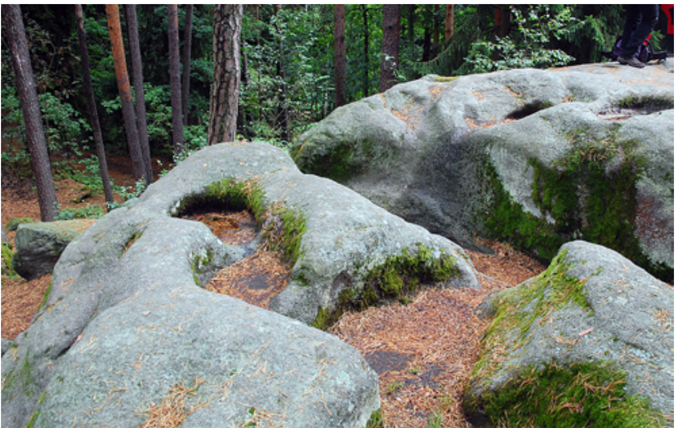
Fig. 5. Weathering pits on the upper surface of Christophorusstein, photo P. Migoń • Kociołki wietrzeniowe na powierzchni szczytowej skałki Christophorusstein, fot. P. Migoń