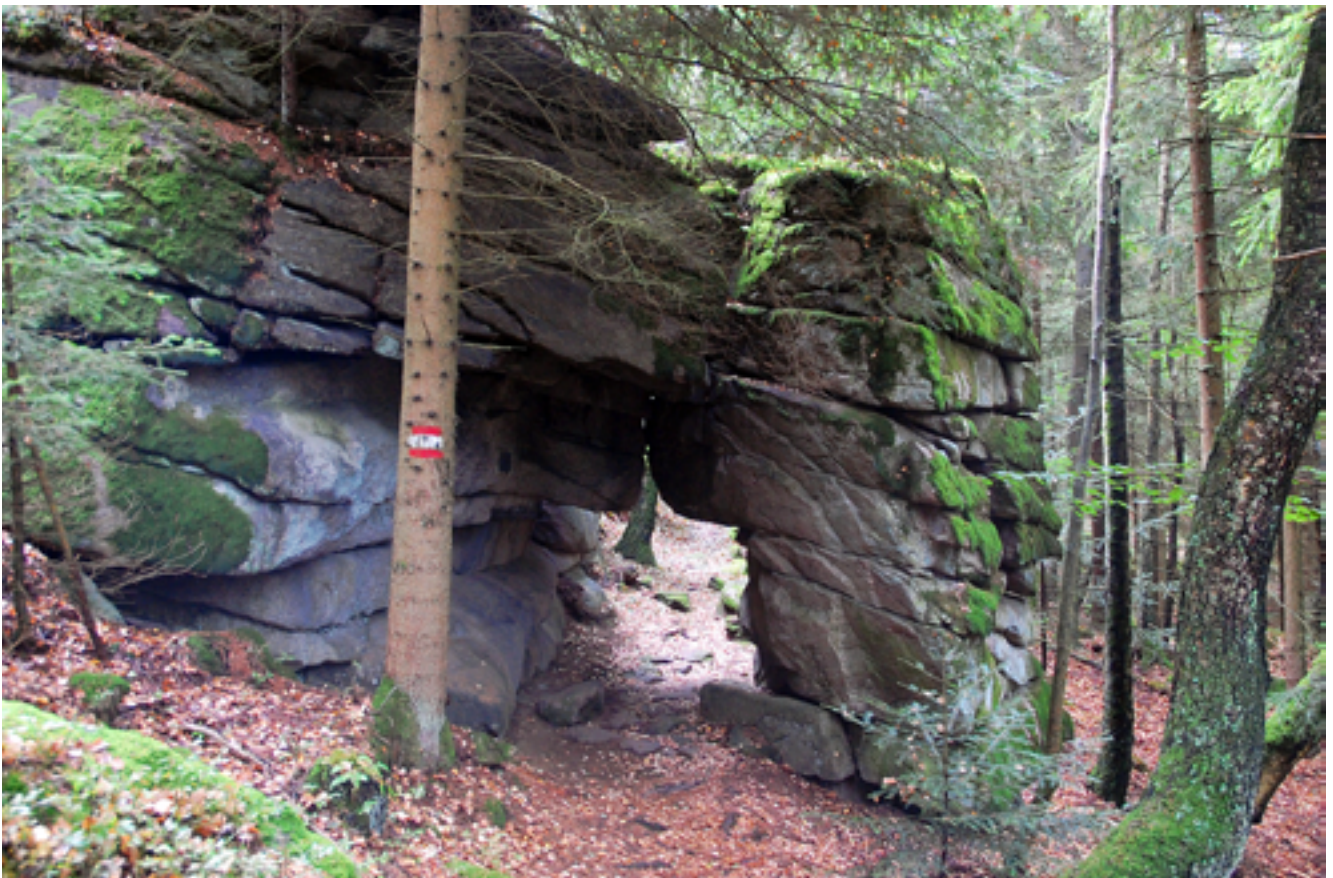
Fig. 18. Natural rock tunnel at Mandlstein, photo P. Migoń • Naturalny tunel skalny na skałce Mandlstein, fot. P. Migoń