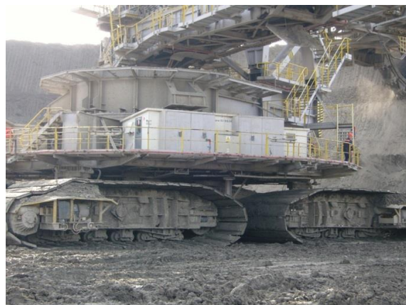
Fig. 3. Tracked undercarriage of the SRs-1800 excavator [1] Rys. 3. Podwozie gąsiennicowe koparki SRs-1800 [1]

Currently, bucket wheel excavators based on tracked undercarriage are being widely applied owing to their unique features (much smaller turning circle and no need to relocate the rails as it was in the case of other types of excavators) - Fig. 3.