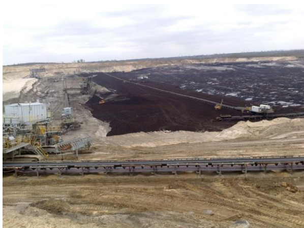
Fig. 1. Surface brown coal mining [1] Rys. 1. Powierzchniowe wydobycie węgla [1]

mines are divided into levels, depending on the depth of the coal deposition (or other excavated medium), type of capping medium and excavators assigned for the works. Fig. 1 presents an example surface mine located in Poland.