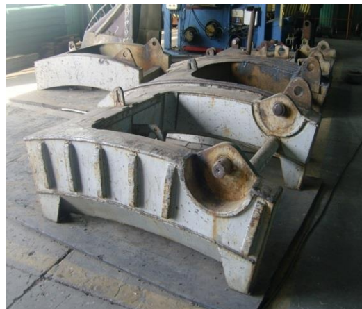
Fig. 6. Bucket wheel recess [1] Rys. 6. Miejsce koła łyżki koparki [1]

A regeneration of an excavator bucket begins with its removal from the machine. The next stage is a thorough cleaning to eliminate the remains of soil and coal. Then, a visual inspection is carried out that qualifies the bucket for regeneration or scrapping. In the latter case, another inspection takes place aiming at selecting parts that can be reused (for example the bucket face) in the process of regeneration of other buckets of the same type. The sleeves used for the fitting of the buckets are always renewed during regeneration, irrespective of their condition, and then the buckets undergo a geometry check on specially prepared wheel recesses (Fig. 6). If the bucket does not match the bucket wheel, it is transported to a device that permanently deforms the bucket (pressing and drawing) to adapt it to the wheel recess.