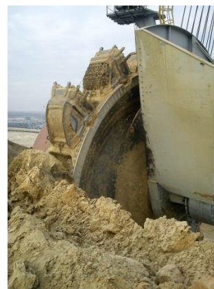
Fig. 4. Full and chain buckets fitted interchangeably on the bucket wheel of a SchRs-900 excavator [1] Rys. 4. Czerpaki pełne oraz łańcuchowe zamontowane na koparce wielonaczyniowej SchRs-900 [1]

Buckets are vessels allowing excavation of the medium from the excavation site. Today, only open buckets are used (buckets of the shape of a bowl with two open spaces). The only existing classification among them is into chain buckets and full buckets. Chain buckets are such that have a chain located on its face serving the purpose of protecting the bucket from the sticking medium and providing better passage of the medium following its dilution. Full buckets are conventional buckets with a face. The buckets of multibucket excavators are classified into a variety of types depending on the machinery, on which they are fitted and the type of work they are designed to perform. Example of buckets is shown in Fig. 4.