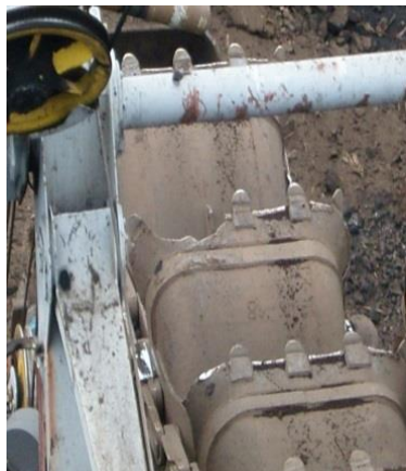
Fig. 5. Damage to the excavator buckets; a) SchRs-900, b) Rs-560, and c) Rs-400 excavators [1] Rys. 5. Uszkodzone czerpaki koparek; a) SchRs-900, b) Rs-560, c) Rs-400 [1]

A regeneration of an excavator bucket begins with its removal from the machine. The next stage is a thorough cleaning to eliminate the remains of soil and coal. Then, a visual inspection is carried out that qualifies the bucket for regeneration or scrapping. In the latter case, another inspection takes place aiming at selecting parts that can be reused (for example the bucket face) in the process of regeneration of other buckets of the same type. The sleeves used for the fitting of the buckets are always renewed during regeneration, irrespective of their condition, and then the buckets undergo a geometry check on specially prepared wheel recesses (Fig. 6). If the bucket does not match the bucket wheel, it is transported to a device that permanently deforms the bucket (pressing and drawing) to adapt it to the wheel recess.