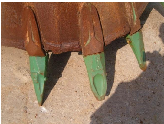
Fig. 7. New teeth fitted on the excavator bucket [1] Rys. 7. Nowe zęby zamontowane na łyżce koparki [1]