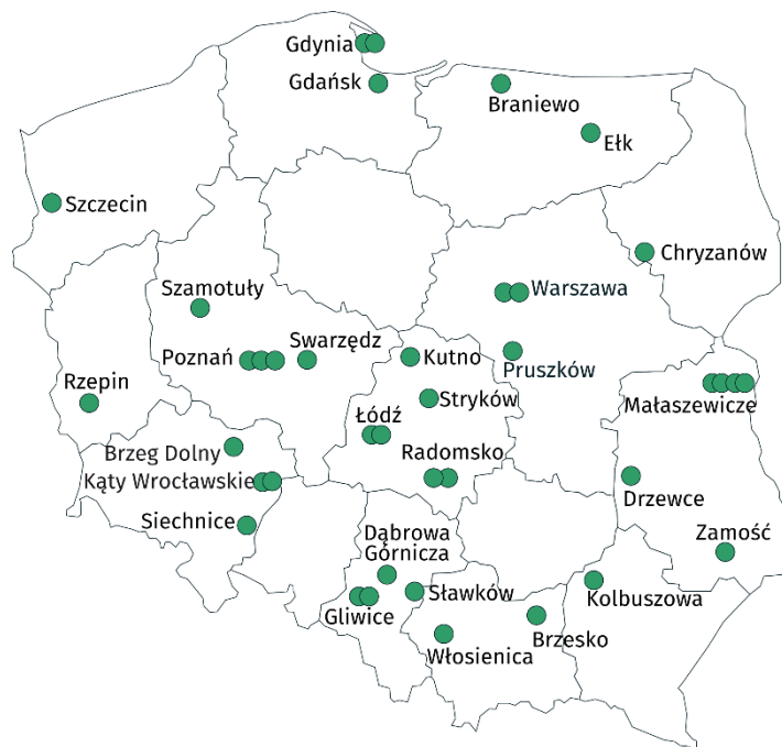
Figure 4.: Distribution of intermodal terminals in 2021