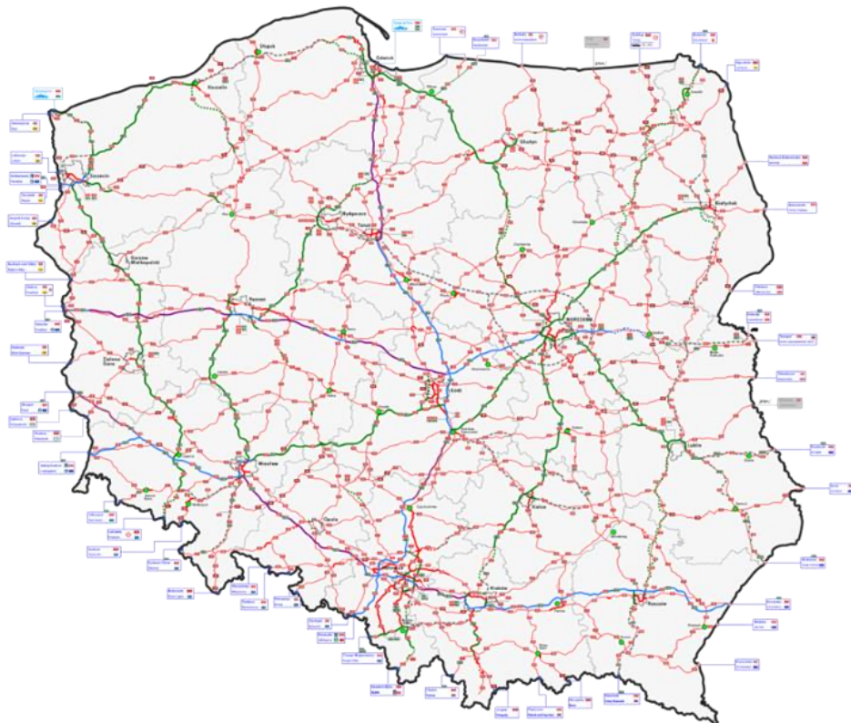
Figure 3. Transport network of Poland (as at 09.02.2021)