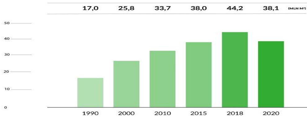
Figure 1: TIMBER SALES BY STATE FORESTS. Thanks to increasing abundance, the State Forests are able to harvest and sell more timber, without worrying about the sustainability of the forests.