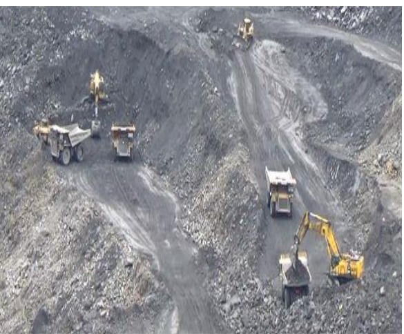
Fig. 1. Synchronization of large-capacity equipment in open-pit coal mining.

Presently, the used equipment fleet is as follow: