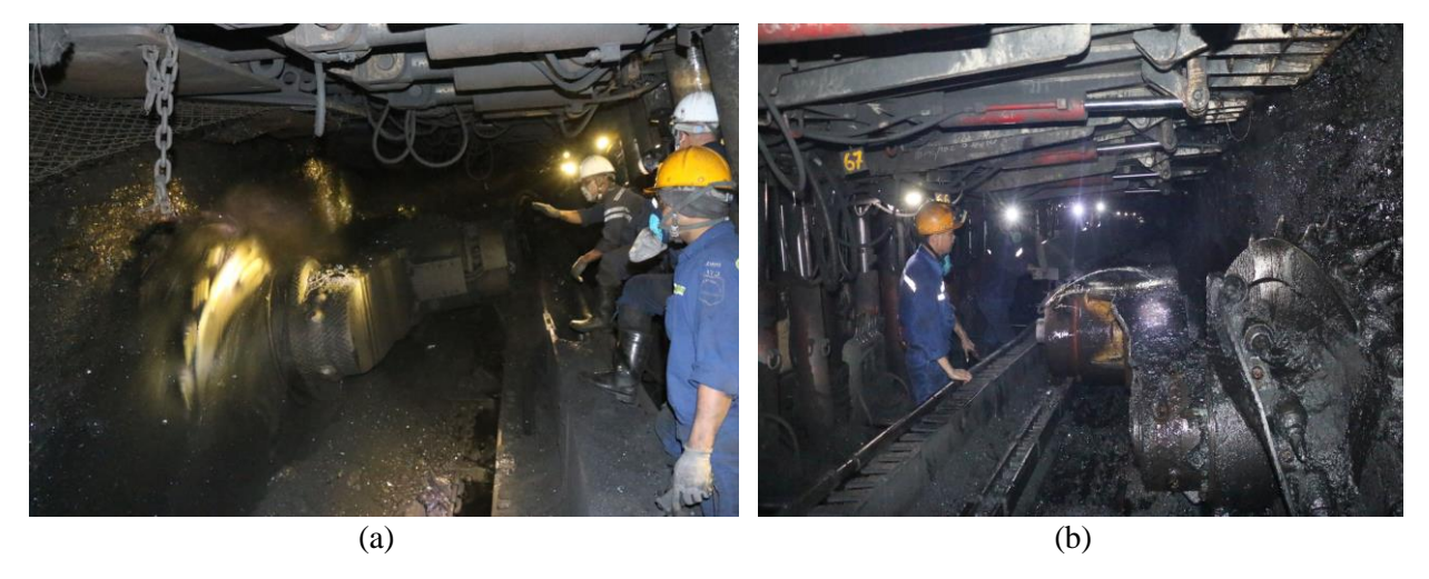
Fig. 3. Synchronized mechanized furnace at Ha Lam Coal Company (a) and Mong Duong (b).