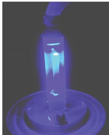
FIG. 1. Light curing on CT stage using limiter.

The Charisma Opal Flow composite has almost the same ratio of components as Flow-Art, but different resin was used. In this case the shrinkage had a value of 2.86% \pm 0.30 . It is noteworthy that spread of all results (S.D.) was very low, which testify the quality of measurements. All results were statistically different on significance level \alpha = 0.05 .