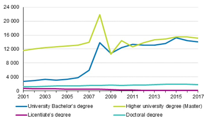
Fig. 2. Students who completed university degrees in 2001-2017 (Statistics Finland, 2018)