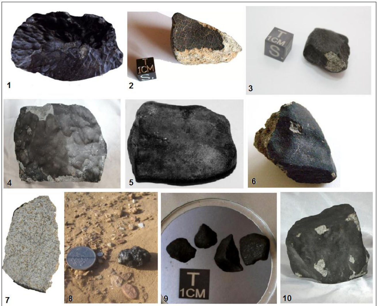
Fig. 2. Meteorite falls from Morocco 1. Douar Mghila (640.85 grams ©MNHNP); 2. Oued el Hadjar (24.78 grams, ©Meteorite.fr); 3. Benguerir (17 grams, ©Ibhi A.); 4. Tamdaght (210 grams, ©Langheinrich meteorites); 5. Itqiy (475.25, ©Labenne meteorites); 6. Oum Dreyga (52 grams, ©Allmeteorite); 7. Zag (45 grams, ©Michel Franco); 8. Tissint (5.3 grams, ©Ibhi A.); 9. Aoussred (24 grams, ©Ibhi A.); 10. Bensour (342 grams, ©Langheinrich meteorites).