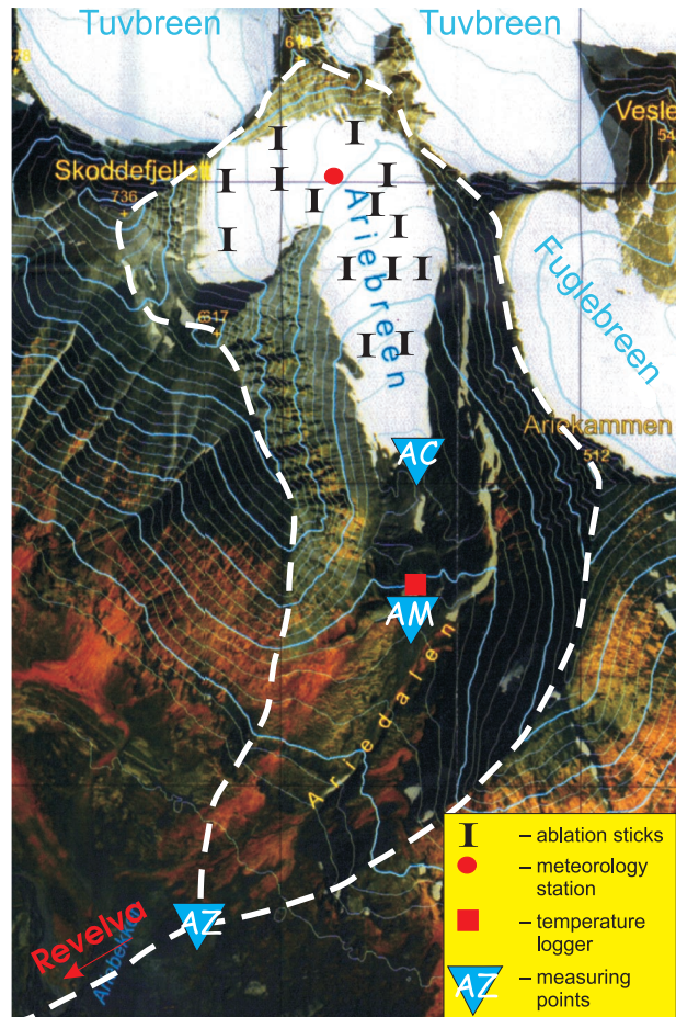
Fig. 2. Monitoring system of Arie basin. Werenskiold-breen Orthophotomap (Kolondra 2002) change by authors

The organization and implementation of the monitoring of polar geoecosystems should rest on a comprehensive concept of the operation of glaciated and non-glaciated geoecosystems (Zwoliński 2005).