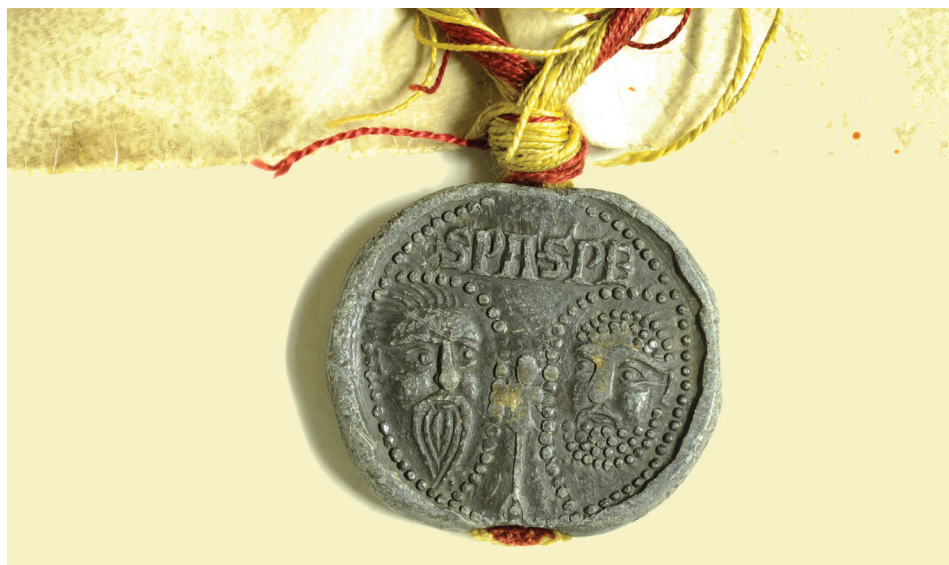
Fig. 5. Papal bull of Pedro de Luna from 1413, which is kept at St. Andrews' Scottish University

Il. 4. Porównanie stylistyki pieczęci dwóch papieżów noszących imię Benedykta XIII. U góry XVIII-wieczna bulla Pietra Francesca Orsiniego. U dołu odnaleziona na zamku Grodno XIV/XV-wieczna bulla Pedra de Luny