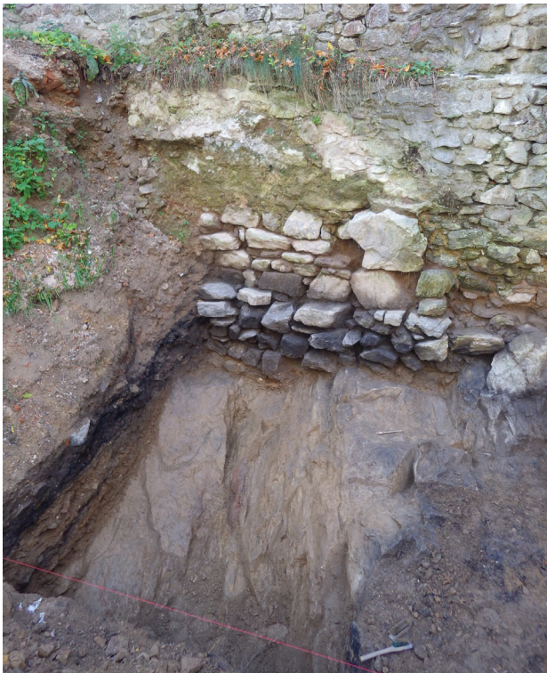
Fig. 3. Probing excavation No. 5 at the wall of the upper castle

Il. 3. Wykop sondażowy nr 5 przy murze zamku górnego