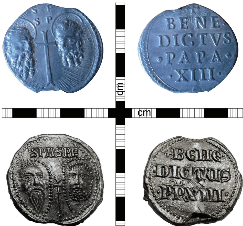
Fig. 4. Comparison of the style of seals of two popes bearing the name of Benedict XIII.

At the top, the 18 th -century papal bull of Pietro Francesco Orsini. At the bottom, the 14 th /15 th -century papal bull of Pedro de Luna discovered in Grodno Castle