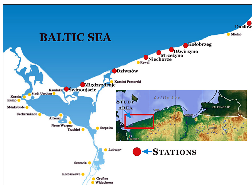
Fig. 1. Sampling sites in the Pomeranian Bay

Twenty-three linear measurements were taken of N. integer female individuals and 24 of N. integer male individuals in each sample according to the methodology presented below, which is a modification and extension of the method by Mauchline [1971]. The measurements were