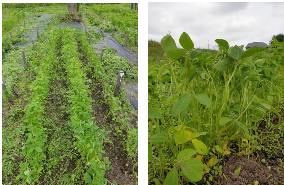
Figure 1. Evaluating biochar impact on soybean yields and other soil ecosystem services in Krakow, Poland.

In a recent paper, Latawiec et al. (2021) evaluated provisioning (food and feed) and regulating (carbon sequestration) soil ecosystem services from biochar use in soybean farming (Figure 1). Among different biochar doses, 60 Mg ha -1 was the most effective one for increasing soybean yields over two years and for two different biochars with additional benefits for water retention. However, the cost of biochar exceeded the potential financial benefits from the yield increase as compared to traditional fertilizer. Carbon sequestration was evaluated based on direct carbon savings in soil following biochar addition. Based on the dose of biochar, the proportion of fixed carbon in biochar (approx. 80%) and the fraction of persistent biochar (70%) Latawiec et al. (2021) calculated financial benefits to farmers from carbon sequestration in soil given three levels of subsidies for tonne of CO 2 eq stored (USD 10, USD 20 and USD 30). They found that if with the subsidy of USD 30 t ha -1 from carbon sequestration, the soybean production with the addition of biochar (40 Mg ha -1 and 60 Mg ha -1 ) would be profitable already in the first year of cultivation. Interestingly, the carbon price would have to be in the range of USD 50 to USD 100 in 2030 to achieve the goals of the Paris Agreement.