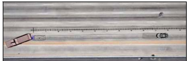
Fig. 10. The beginning of the car's braking T = -2,5 sec

Taking into account the reaction times, if the self-propelled system had started to brake, then the stationary car would have become recognizable 50-60 meters before the collision, if the human driver had recognized the emergency, then the reaction point would have been approx. 73 to 78 meters.