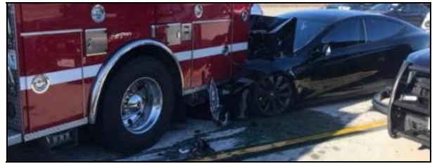
Fig. 9. The end position of the collision

Based on the speed of travel and collision, the Tesla started breaking at approx. 45 to 55 meters before the point of the impact. Figure 9 shows the end position of the collision.