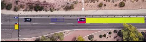
Fig. 7. The expected detection distance

the danger to the driver. Figure 7 depicts a different area. The area of the vehicle which is marked with yellow, and the further area are the ones from which, in reality, it would be not possible for the human eye to detect a pedestrian, and in the case of an autonomous vehicle, an earlier detection, independent of the weather and visual conditions, is necessary. With proper detection, the vehicle could be halted by intensive braking before the path line of pedestrian.