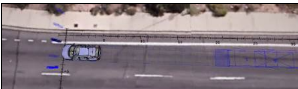
Fig. 8. The accident process in the case of adequate autonomous function

Based on the investigation of the avoidance of the accident, it can be stated that the detection and determining of the self-drive system was correct. According to own calculations, the Volvo could have been stopped before the pedestrian's travel path, 2.5 to 6 seconds prior to the accident.