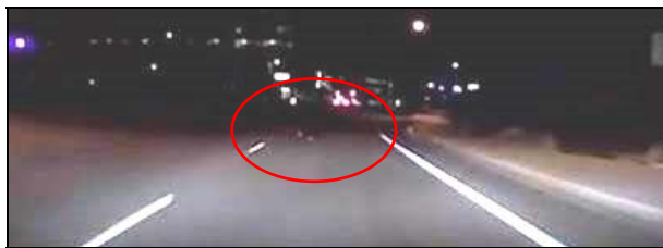
Fig. 3. The moment of pedestrian perception

Figure 3 is a screenshot from the video when the pedestrian becomes visible to a driver.