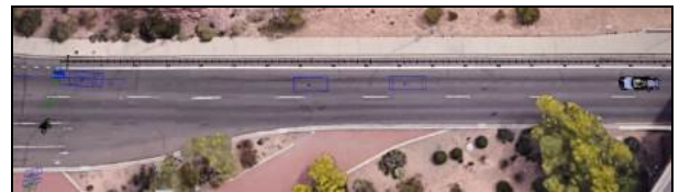
Fig. 4. The mutual position of the participant's T – 4,5 sec

Figure 4. shows the situation when the pedestrian walked to the middle of the road 4.5 seconds before the collision with the vehicle. The Volvo was 80-85 meters away from the point of impact. From this distance the pedestrian did not pose a dangerous situation because the vehicle with a normal brake manoeuvre can be stopped, before the hitting point.