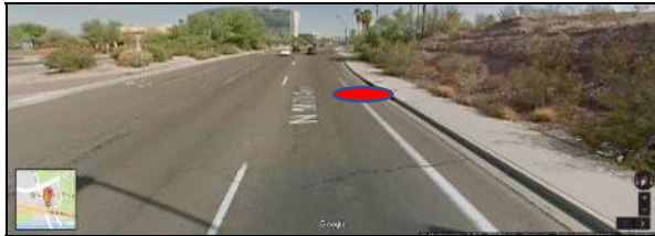
Fig. 2. The collision location (Google Earth)

Figure 2 shows the street view, where the location of the collision was specified.