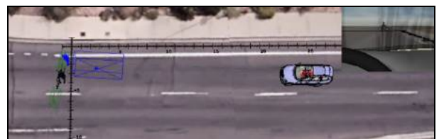
Fig. 6. The mutual position of the participant's T – 1,25 sec

Fig. 6 depicts a simulated moment corresponding to Fig. 5. The vehicle is then approx. 20 to 25 meters from the collision site. From this distance the vehicle with an emergency brake manoeuvre cannot be stopped before the pedestrian's travel path.