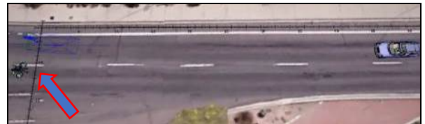
Fig. 5. The mutual position of the participant's T – 2,5 sec

Figure 5. shows the next situation when the pedestrian reached the lane along which the Volvo car was travelling. The vehicle is then approx. 43-47 meters, pedestrian approx. 4-5 meters from the point of hitting. In this case, a vehicle with an intensive brake manoeuvre can be stopped.