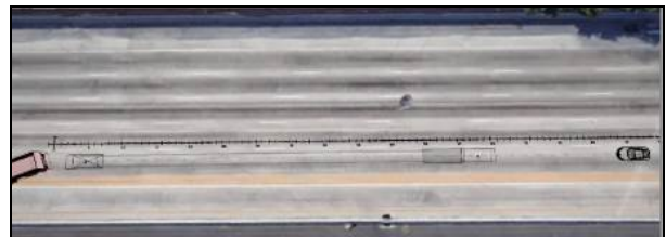
Fig. 11. The case of the safely standstill of the Tesla

In order for the Tesla car to stop safely behind the fire truck the self-drive system should have recognized the danger before the point of impact approx. from 62 to 67 meter, the human driver approx, from 82 to 87 meter. Figure 11. illustrates the breaking process with human reaction time.