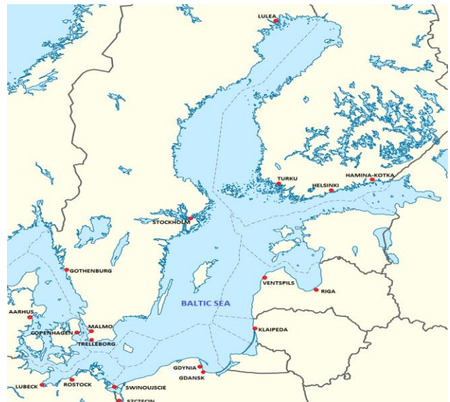
Figure 1. Distribution of core Baltic Sea ports (Baltic Port Critical Infrastructure Network - BPCIN) [2]

Baltic core ports is fixed as 18. These ports distribution at the Baltic Seaside is illustrated in Figure 1 .