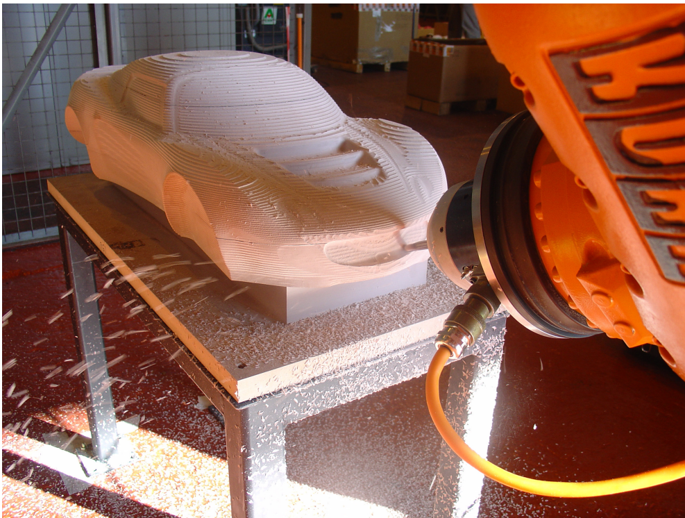
Fig. 3. Robot machining was demonstrated by Delcam at the recent JEC exhibition

One of the key aspects of the COMET project is to address the lack of accuracy when machining with robots (fig. 3). The project separates this into two main aspects: offline compensation and online compensation. The online compensation uses optical measurement equipment from Nikon Metrology to correct the robot position during machining operations. The offline compensation identifies the key error sources of the robot and compensation routines are then developed for the most relevant ones. The offline compensation is also available as a plug-in inside PowerMILL and works seamlessly together with the PowerMILL Robot Interface. Kinematic offline compensation is able to compensate for slight alignment errors and manufacturing tolerances within the robot structure. Each robot cell is measured with an optical tracker and the result is used inside the offline compensation to adjust for the kinematic errors.