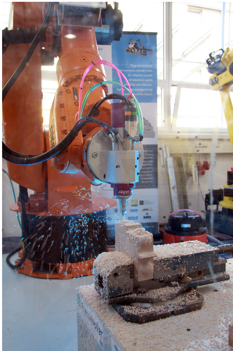
Fig.4. Extensive trials of the new Interface have been undertaken within the COMET project

Compensation also needs to be considered for joint effects. Each joint within the robot arm has errors such as backlash (the main error source in robotics), compliance and friction effects. An embedded simulation model of the joint dynamics allows for emulation and compensation of these joint errors, which depend on the load on the robot and on the estimated cutting forces. In this way, the actual robot -joint effects can be foreseen at the engineering stage. In the project, machining tests have shown the effects of the identified errors when machining aluminium and steel with industrial robots. The offline compensation has been proved to be able to compensate for a significant amount of the error. However, while the PowerMILL Robot Interface is now available for Delcam's customers, the different COMET solutions to compensate for robot errors are still under development and are currently only available to the consortium partners as prototype components (fig. 4).