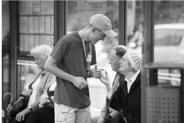
Fig. 5. Mobility assistance at big interchanges (Poland)

on such major transport interchanges in rural areas, as their number is smaller and most of the travellers will very likely pass these limited number of major transport interchanges along their journey.