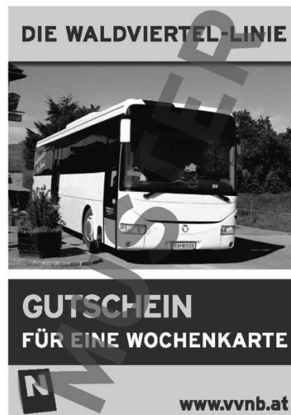
Fig. 6. Test tickets voucher for the bus lines Waldviertel-Linie (Austria)

In Austria, during the Waldviertel line individualised marketing campaign, in total 229 weekly passes were distributed among interested persons (fig. 6). The measure was included in the individualised marketing campaign itself. The measure was sponsored by the regional public transport umbrella organisation. The try out tickets were sent by surface mail and were included in the information package ordered by the target persons during the campaign. Cost depending on the value of the ticket. Usually the distribution of the tickets is an integrated action with other events and generates no significant marginal cost.