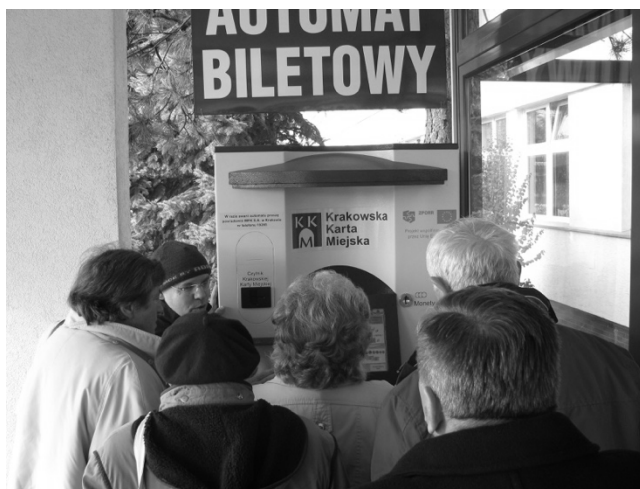
Fig. 2. Explaining the ticket vending machines, city of Krakow (Poland)

safety handbook should be published and a variety of other marketing measures that address the target group of older people should be introduced.