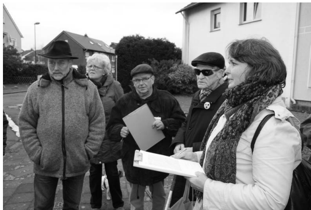
Fig. 3. Mobility checks with elderly people (Germany)

This measure bases upon the identification of problems of elderly people to cover distances in their daily trips. Together with stakeholders or planning staff members the elderly people walk through a district or local centre to inspect by foot possible barriers in their daily ways. With mobility checks the affected group is involved directly in the planning process. Stakeholders are faced with and sensitised on their problems. Objectives of these activities are (I) to promote independent mobility of the elderly; (II) to increase passive/active safety of older people; and (III) to generate local knowledge on the needs of the target group.