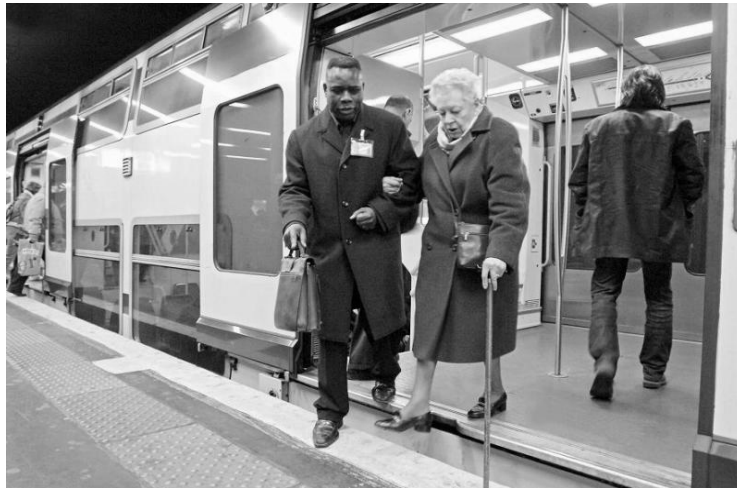
Fig. 4. Personal mobility assistants for elderly passengers (France) Abb. 4. Ein persönlicher Mobilitätsassistent für ältere Fahrgäste (Frankreich)