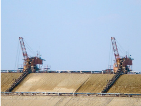
Fig. 2. A detail from the Majdan III open pit mine, showing bucket chain excavators and conveyor belts of the ECS system

The short review of the opening of the Majdan III open pit mine and the construction of the ECS system given here is helpful in understanding the problem, and confirms the rule of mining engineering that the path from the task and an idea to the project solution and realization is not straightforward.