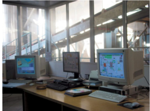
Fig. 3. A detail from the command post of the Majdan III open pit mine showing ECS control system