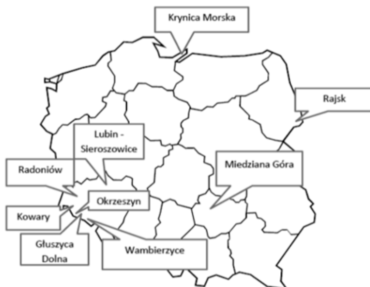
Fig. 2. Distribution of uranium ore in Poland