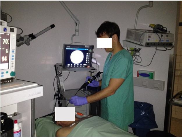
Fig. 1. Snore sound data acquisition system (Munich). A flexible nasopharyngoscope was used for recording the video of the upper airway (Storz, Germany at the Munich and Halle sites; Olympus, Germany, at the Essen site) connected to a video recording system (Telepack X, Storz, Germany, at the Munich site; AIDA, Storz, Germany, at the Halle site; rpSzene, Rehder/Partner, Hamburg, Germany, at the Essen site).

(refer to Fig. 2) localisation classification (KEZIRIAN et al. , 2011).