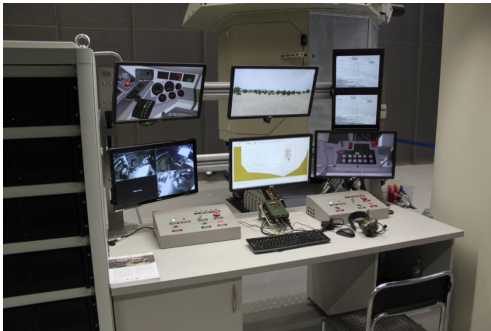
Fig. 7. Instructor's station in the complex KTO Rosomak training simulator

At this moment, both simulators are connected via a shared instructor's station, which allows for training the entire vehicle crew (driver, commanding officer, gun crew commander) all at the same time. Such a solution enabled the implementation of tactical training, where the instructor specifies the subject of the assignment, provides guidelines for the vehicle commander, and the rest of the task is completed through communication of the crew, all under the instructor's supervision.