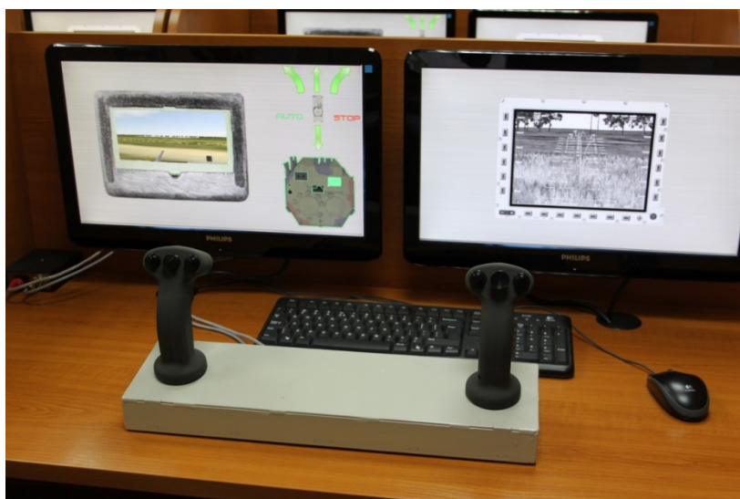
Fig. 3. Fire Training and Special Systems' Room

CBT computers allow the HITFIST 30 mm turret crew to learn and practice all processes and procedures of the original Fire Control System, and thanks to the use of manipulators, the trainees develop proper manual habits and abilities. The software allows for conducting simulated fire operations at stops, during brief stops, aiming at real-life targets, both immobilized and mobile. The simulation includes the effects of a shot being made, depending on the missile type used, considering its ballistics properties. The visualization software allows for generating shooting targets characterized by the properties of real-life training targets. The visualization can generate a virtual shooting range, including such elements as targets, smoke, etc. The above-specified devices were also launched in 2011 and have been used since in the training process implemented in the company.