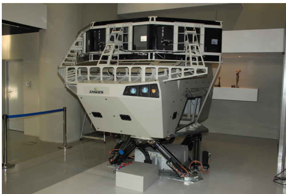
Fig. 4. “JASKIER” – the KTO Rosomak driver’s simulator

The JASKIER – KTO Rosomak driving simulator is intended for the initial stage of driver’s training, and aims at developing driving skills in adverse and dangerous conditions. Furthermore, the simulator is fully programmable with various types of exercises. The design team developing the simulator assumed that the system should utilize a mobile platform adjusted in 6 degrees of freedom, which should be sufficient for reflecting the behaviour of actual equipment.