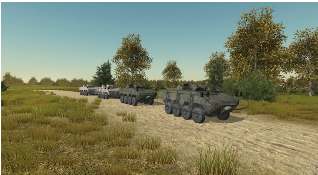
Fig. 6. Model visualization developed for the purpose of depicting the area in reference

The software allows for conducting simulated missile fire during vehicle stop, during brief stops, to real-life targets, both immobilized and mobile. Depending on the type of missile used, the simulator produced a fire effect, considering the missile's ballistics. The visualization software allows for generating shooting targets characterized by the properties of real-life targets. The simulator debuted at the 2013 International Defence Industry Exhibition in Kielce, where it received the award of the President of the Republic of Poland.