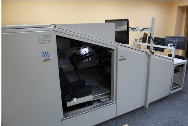
Fig. 2. "ROSICZKA" – KTO Rosomak driver's simulator