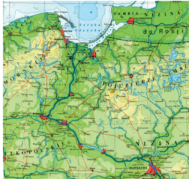
Figure 2. The catchment of the Lower Vistula

The discharge of the Vistula into the sea is now through an artificially formed (in 1895) direct channel (Przekop in Polish). This solution was justified mainly for the improving of outflow to the sea. The previous layout of the final Vistula section resulted in frequent and numerous winter floods, which were caused predominantly by ice jams. An ice jam in 1829 resulted in flood in the city of Gdańsk where inundation reached the second floor of buildings, causing significant economic and social losses.