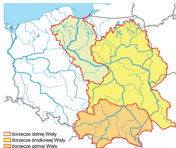
Figure 1. The division of Vistula River Basin into 3 subcatchments

The division of the Vistula basin into three subcatchments (upper, middle and lower) is presented in Fig. 1.